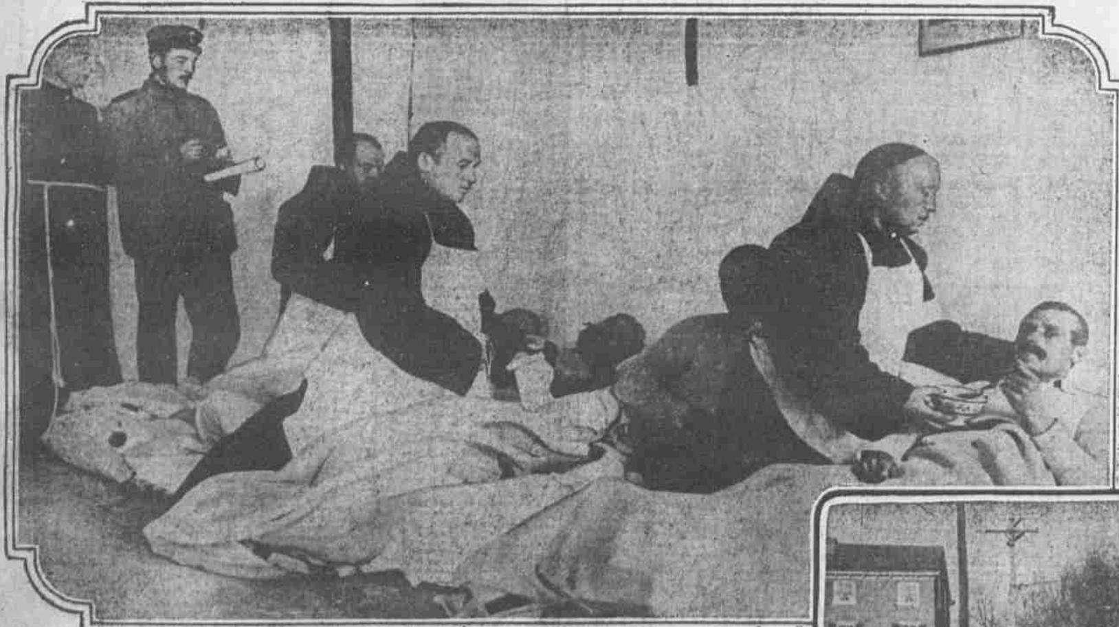
FRENCH MONKS MINISTER TO GERMAN WOUNDED This photograph was taken in a monastery in Northern France now used as hospital.