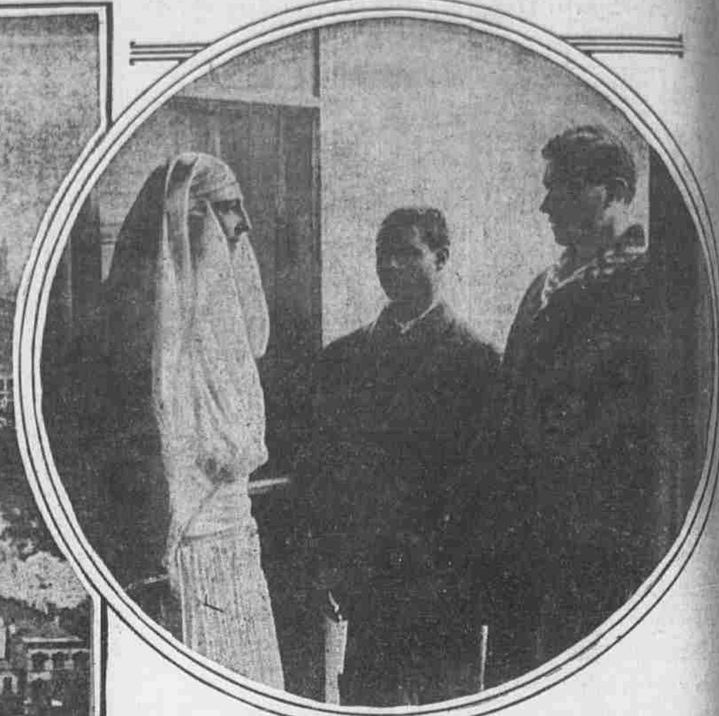
FOOTLIGHTS FAVORITE A WAR NURSE Mlle. Ida Rubenstein, the Russian actress, is receiving wounded soldiers at the hospital in Paris which she has equipped and presented to France.