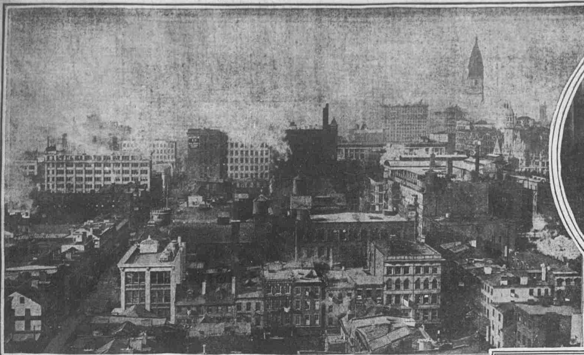
SKYLINE OF CITY TOWARD THE WEST OBSCURED BY OVERHANGING PALL OF SMOKE This view, looking to the west, was taken from the top of the Curtis Building on Independence Square on a clear day. It is sufficient testimony as to why there are so few photographs of Philadelphia's really imposing skyline—most of the time it is invisible on account of the clouds of smoke issuing from office buildings, factories, apartment buildings and hotels. Only City Hall tower stands clear above the murky clouds.

A PAGE FROM THE NEWS OF THE DAY AS RECORDED BY THE EVER-WATCHFUL CAMERA MAN