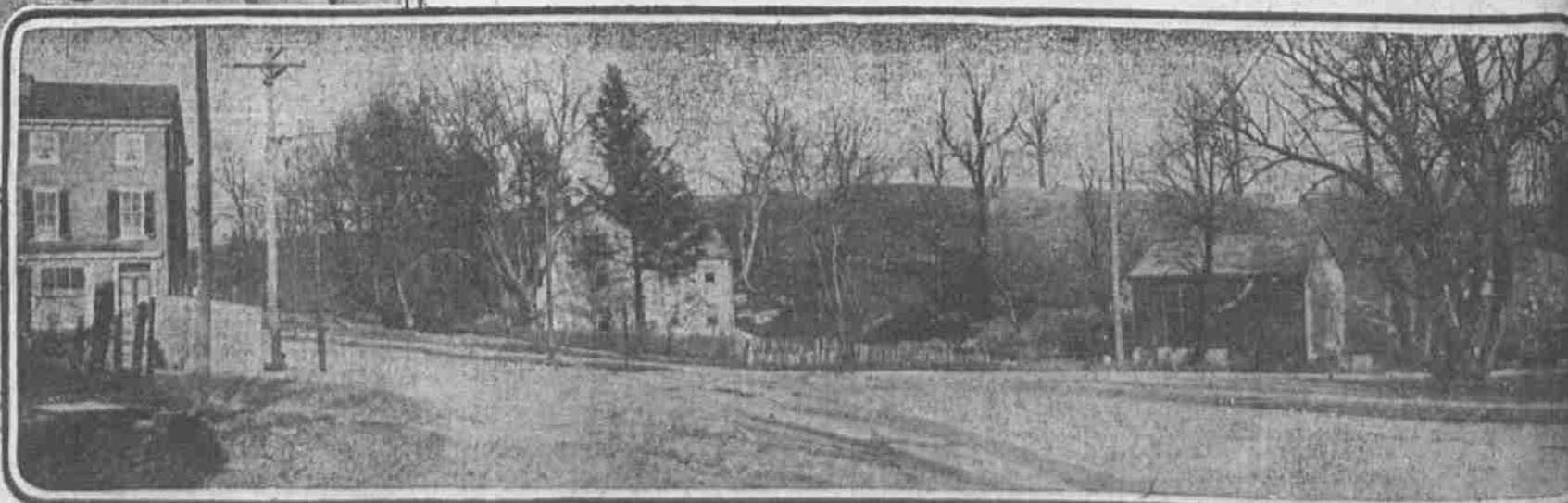
PARK ENTRANCE IN GERMANTOWN TO BE BEAUTIFIED AND ADORNED WITH STATUE A circle is to be created out of the plot in the foreground, at the intersection of Rittenhouse street and Wissahickon avenue, on which will stand a statue of David Rittenhouse.