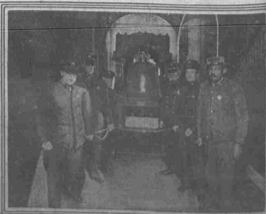
RESCUING THE LIBERTY BELL FROM POSSIBLE FIRE IN TWO MINUTES A drill, accompanied by the proper apparatus, has been perfected in Independence Hall to safeguard its famous relic against fire. At a signal the employees spring to their ropes like fire horses and in 40 seconds have the old bell rolling out on its side.