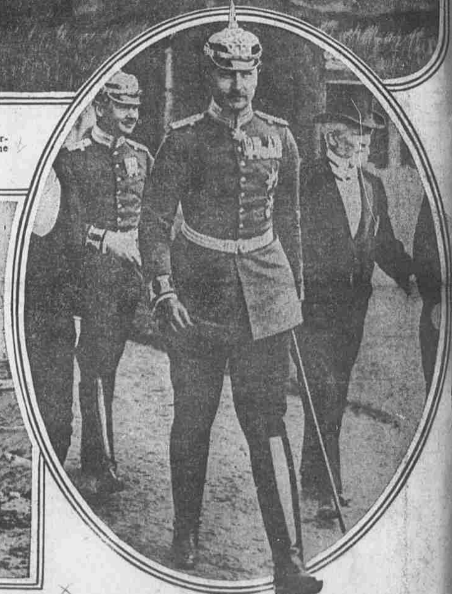
THE KAISER'S PLUMP SON REPORTED CRIPPLED

Great Britain is reported to have a million and a quarter men now undergoing a course of sprouts in preparation for active service against the Kaiser in the spring.