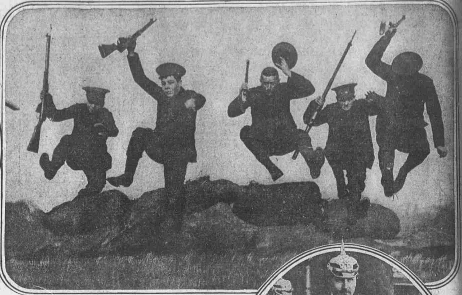
KITCHENER'S NEW ARMY PRACTICES ATHLETIC FEATS

Great Britain's monarch has recently followed the example of the heads of the other nations at war in inspecting troops at the front. This time he appears without his usual panoplied staff.