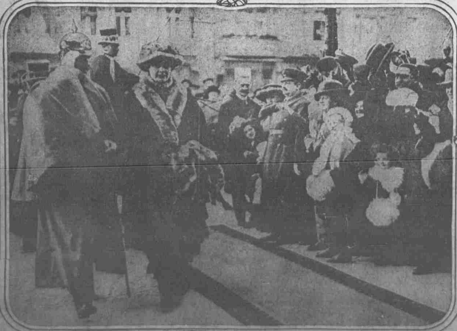
CROWN PRINCESS ACCLAIMED BY LOYAL SUBJECTS IN BERLIN

Crowds gathered around to cheer when the future Empress of Germany recently appeared on the streets of Charlottenburg in the capital on her way to attend a benefit performance given for war sufferers at the Imperial Opera House. The Crown Princess and her son are exceedingly popular with all Germans. She has much charm and vivacity.