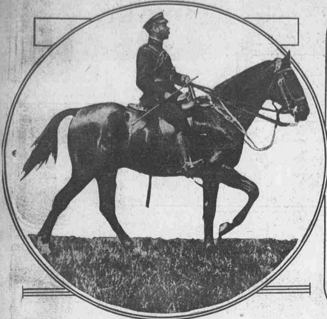
KING GEORGE VISITS WAR ZONE

A PAGE FROM THE NEWS OF THE DAY AS RECORDED BY THE EVER-WATCHFUL CAMERA MAN