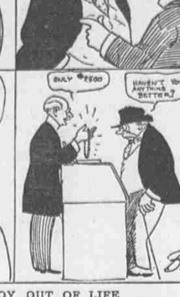
SOMEBODY IS ALWAYS TAKING THE JOY OUT OF LIFE