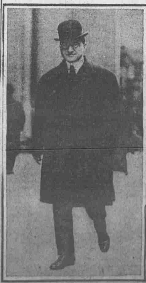
PITTSBURGH'S FORMER MAYOR

The blizzards which have descended upon the lines of the opposing armies in Belgium have been especially severe on the Germans, who are far from their base of supplies. An outpost squad occupying a village is shown here answering an alarm to the effect that patrols of the enemy have been discovered nearby. The ice has to be kept off, no matter what the weather man sends.