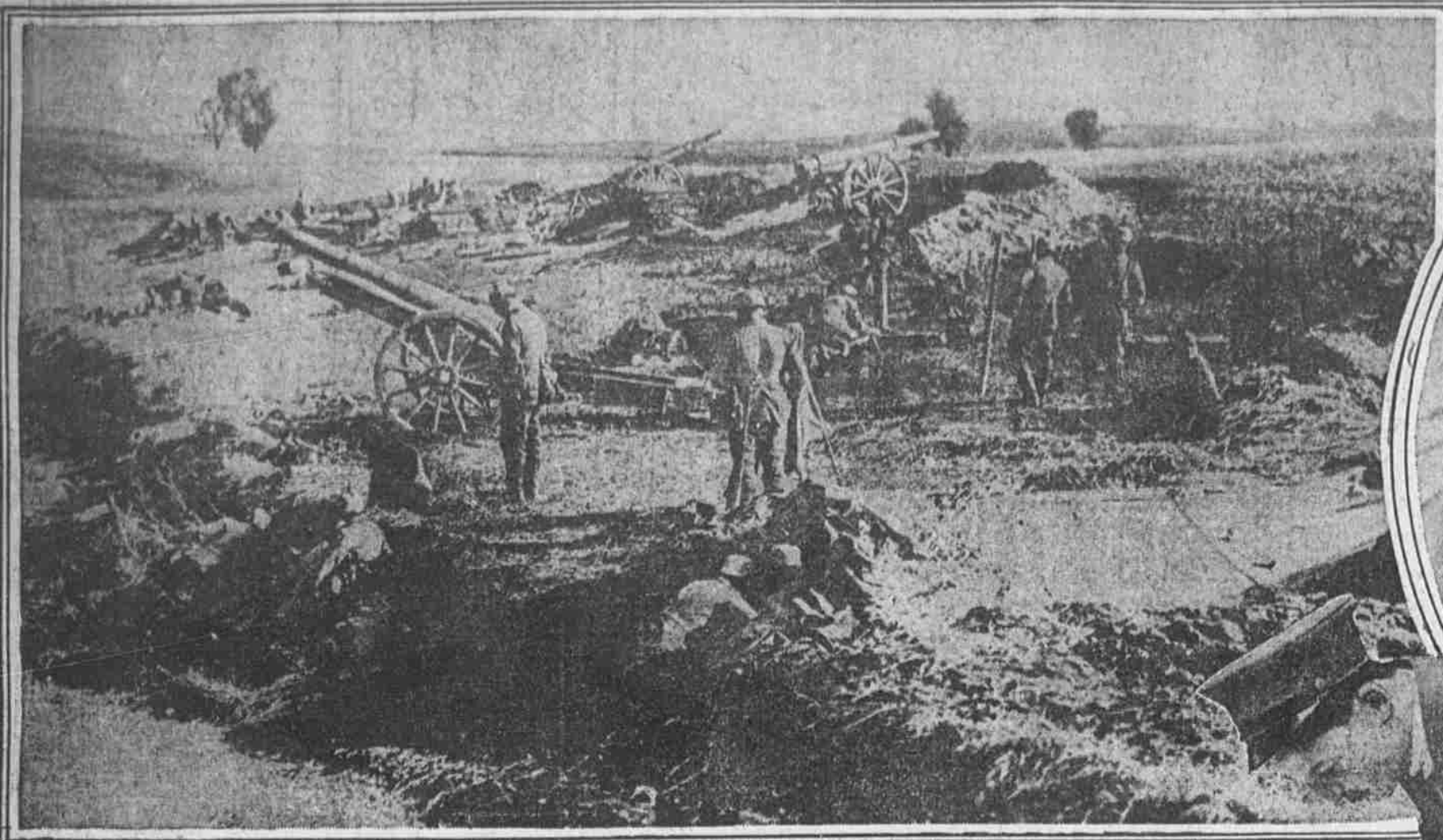
RUSSIAN SHELLS BURSTING ON GERMAN TRENCHES IN POLAND

This is the first photograph received in this city clearly showing how shells appear when exploding on a line of earthworks. In this case, the Russians had not yet found the exact range, but their fire was getting hotter every minute and the Germans in these advanced trenches are already beginning to hug cover under their dug-outs. The white puffs are mostly from bursting shrapnel.