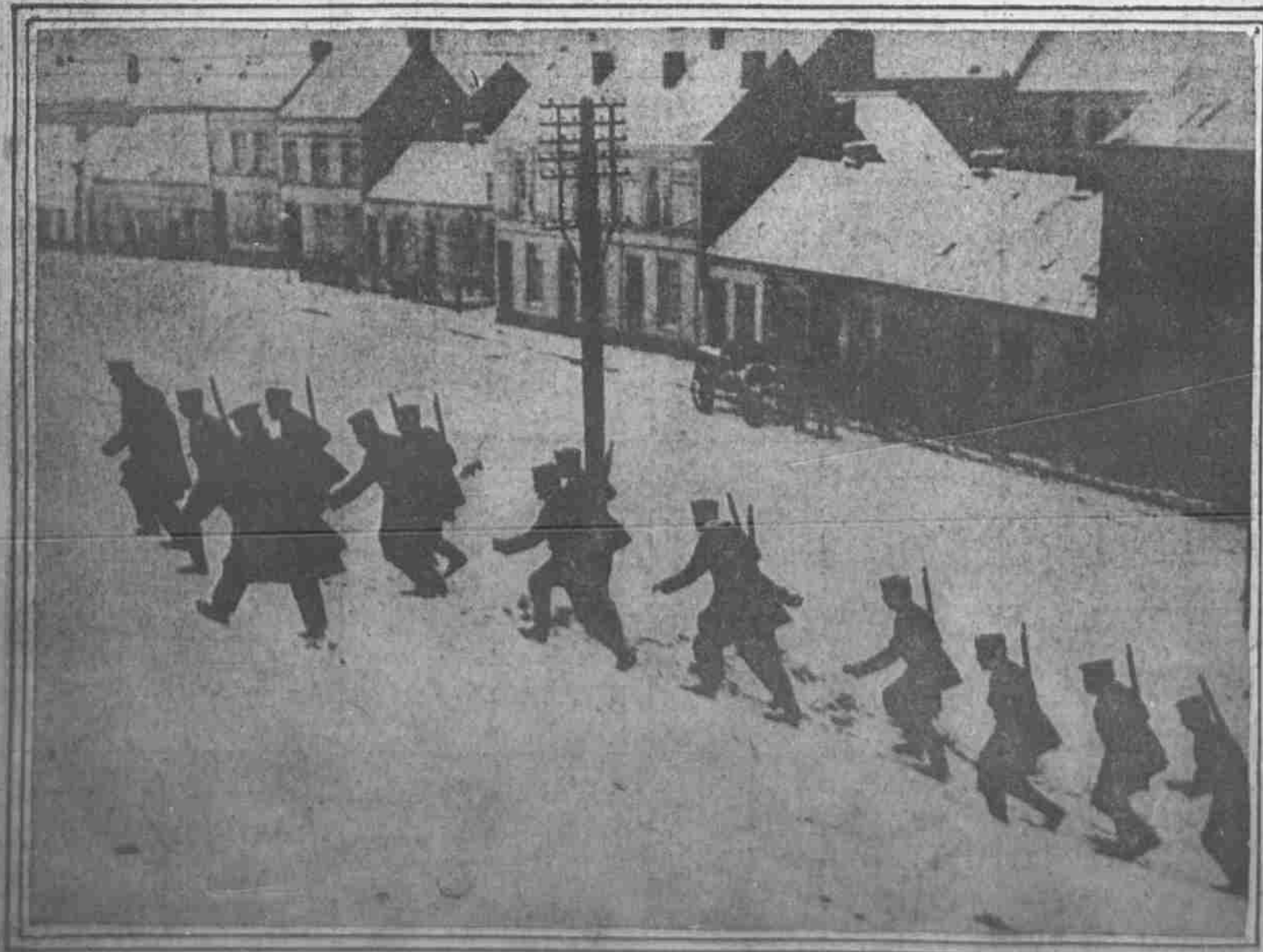
CHARGING UP A SLIPPERY HILL IN SNOW-CLAD FLANDERS

The blizzards which have descended upon the lines of the opposing armies in Belgium have been especially severe on the Germans, who are far from their base of supplies. An outpost squad occupying a village is shown here answering an alarm to the effect that patrols of the enemy have been discovered nearby. The ice has to be kept off, no matter what the weather man sends.