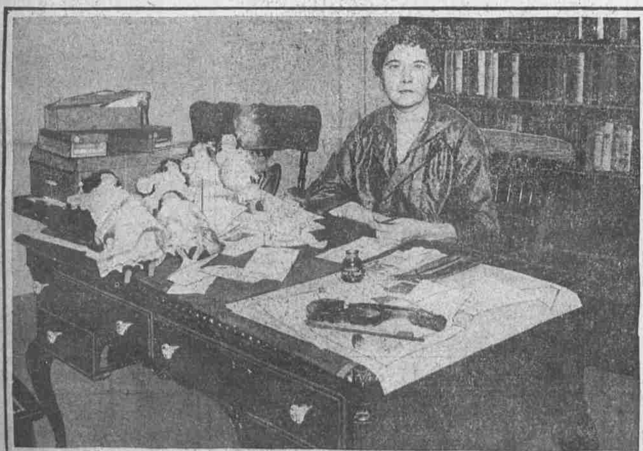
"THE ANGEL OF KENSINGTON" PREPARES FOR WINTER HARD ON POOR