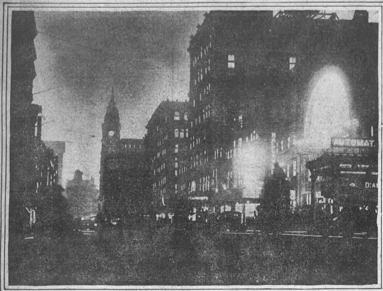
WHEN THE CITY'S LAMP LIGHTERS WERE CALLED OUT AT 3 P. M. The Philadelphia Electric Company was compelled to start up its lights in the afternoon yesterday for the first time in 15 years. The photograph shows how Market street appeared shortly after 3 o'clock.