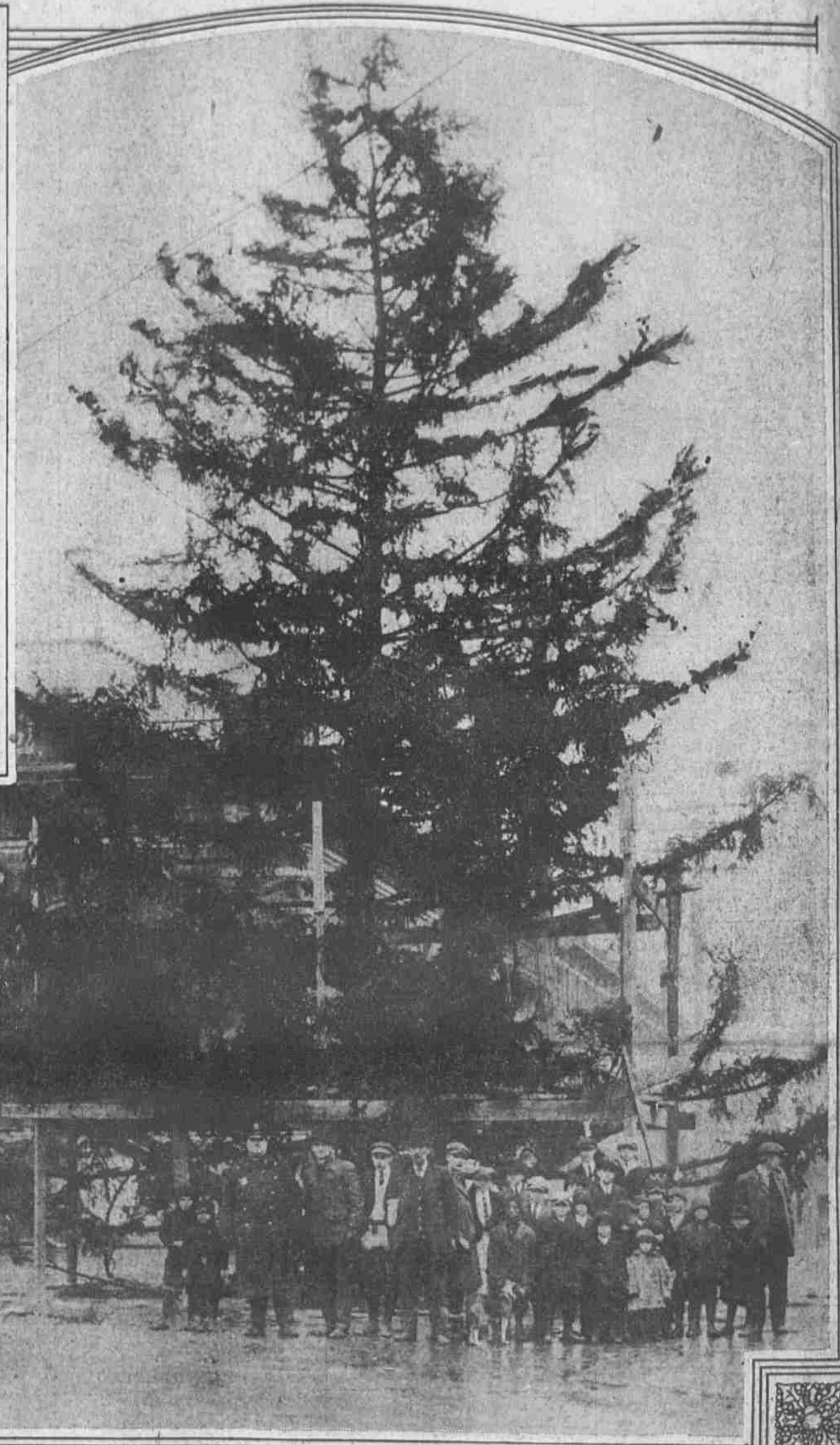
LANCASTER AVENUE HAS COMMUNITY CHRISTMAS TREE FOR CHILDREN

This magnificent tree, 65 feet high, stands at 40th street and Lancaster avenue ready for its myriad lights to be turned on by Mayor Blankenburg next Monday. It was a present from Anthony J. Drexel. Gifts from it will be distributed in automobiles on Christmas day by members of the Lancaster Avenue Business Men's Association. They are now actively at work collecting the presents. It is called a community Christmas tree because it is intended for the many children and numerous families of this particular neighborhood.