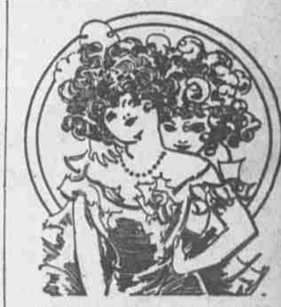
Phoebe-'I saw Jack yesterday. Why didn't he keep his appointment with you?" Agnes—"He broke his arm," Phosbe—"But he didn't come the next day either." Agnes—"Well, you see he broke his arm in two places."

YOU COULD SCARCELY BLAME GRANDPA IN MISTAKING SISTER'S NEW HAT FOR HIS SKULL CAR