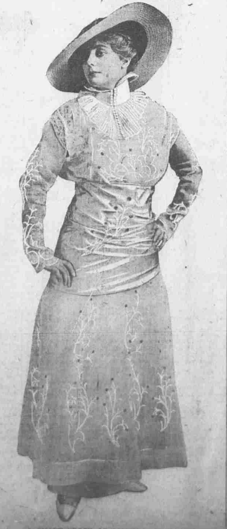
A SMART FROCK OF PLEASING DESIGN

Every one except one on the tip, tip top of the big tree.