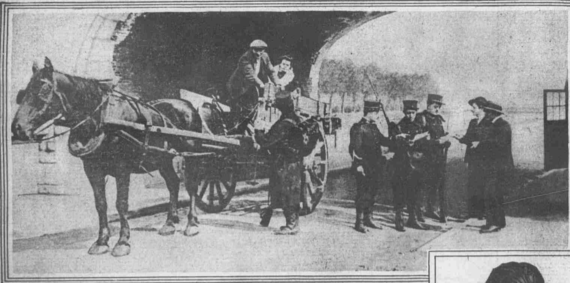
SOLDIERS OF QUEEN WILHELMINA ARE ACTIVE, TOO Holland's troops are maintaining a close watch on their frontier during these troublous times and all travelers are halted to have their papers examined. The entire Dutch army of about 350,000 men was mobilized in the early days of the war. The country in some districts is virtually under martial law and soldiers stand guard every where.