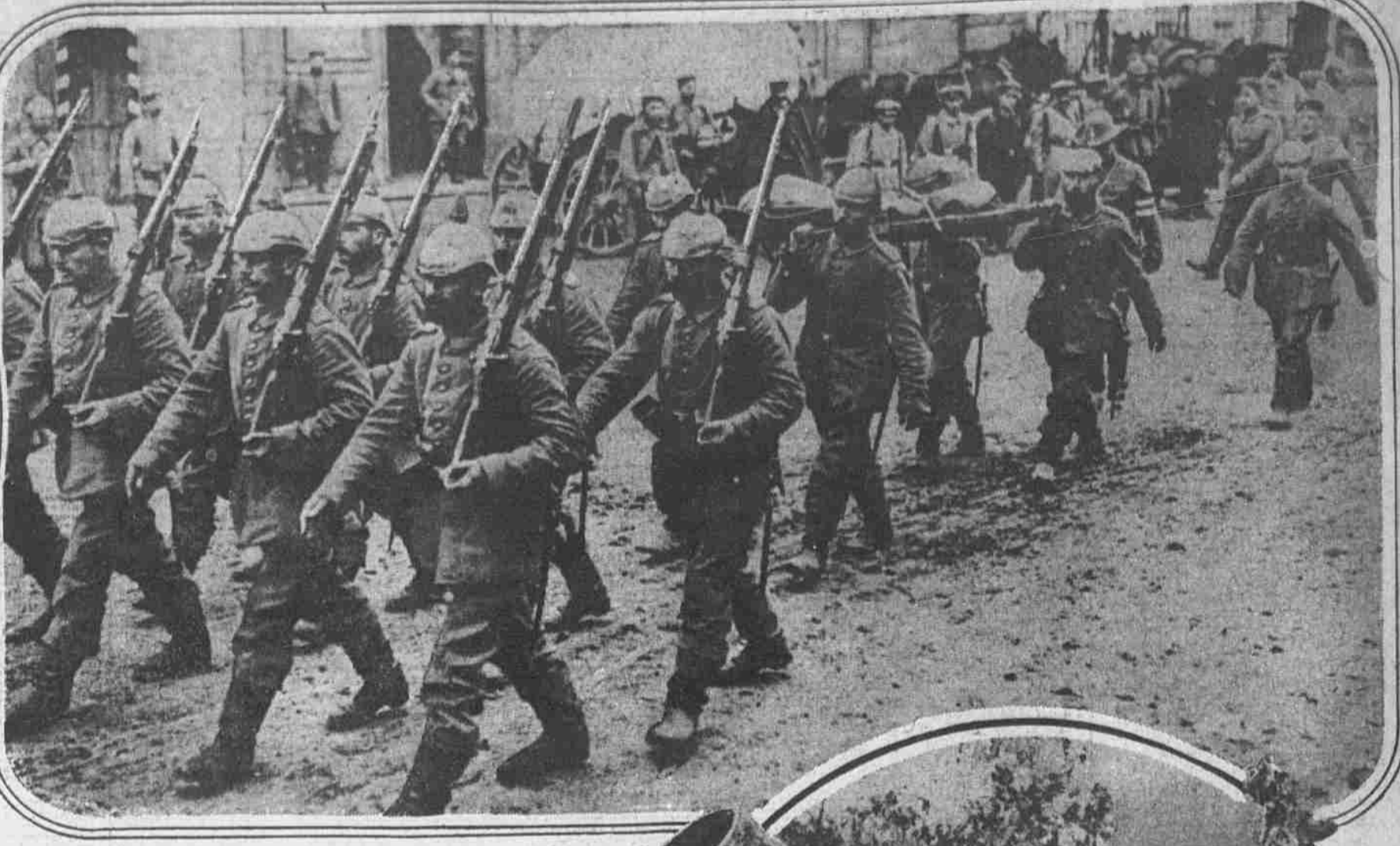
GERMAN SOLDIERS BURYING FRENCH OFFICER The soldiers of the Kaiser are shown carrying the dead officer's equipment on the way to the grave. He was captured when wounded and his gallantry caused this mark of respect to be shown his body.