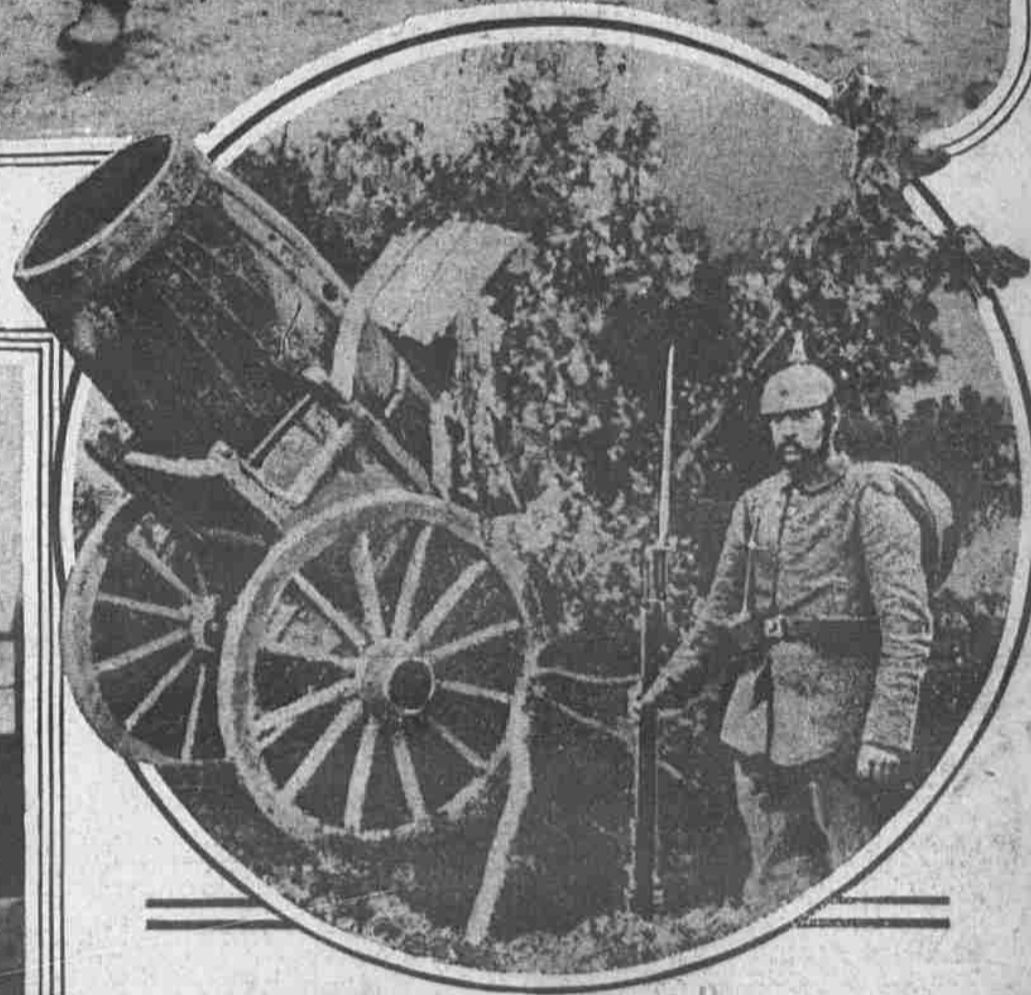
DEVICE TO DRAW THE ALLIES' BIG GUN FIRE This contrivance, made to look like a 42-centimetre gun, was rigged up by German artillerymen out of an old barrel and a cart. Such devices are often employed by the opposing armies to cause a demonstration by hidden batteries.