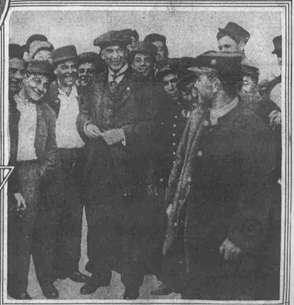
CONVICTS GREET REFORMER AS NEW WARDEN Thomas Mott Osborne, new warden of Sing Sing Penitentiary, is shown surrounded by the men whom he purposes to help, in the yard of the prison grounds a few hours after his appointment.