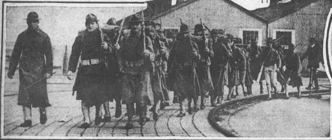
OVERCOATS FEEL GOOD AFTER LONG MONTHS IN TROPICS The marines who are back from Vera Cruz disembarked from their transports all huddled up in their long military coats. They complained the chilly air of Philadelphia ate into their bones, though it was not considered uncomfortably cold here.