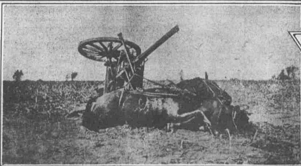
SILENCED BY A SINGLE AUSTRIAN SHELL This striking photograph is mute evidence of a battle fought in Galicia with the Russians. The horses lie just as they fell, suddenly crumpled up in a heap, the gun barrel pointing to the sky, in the midst of a field the battery was trying to cross.