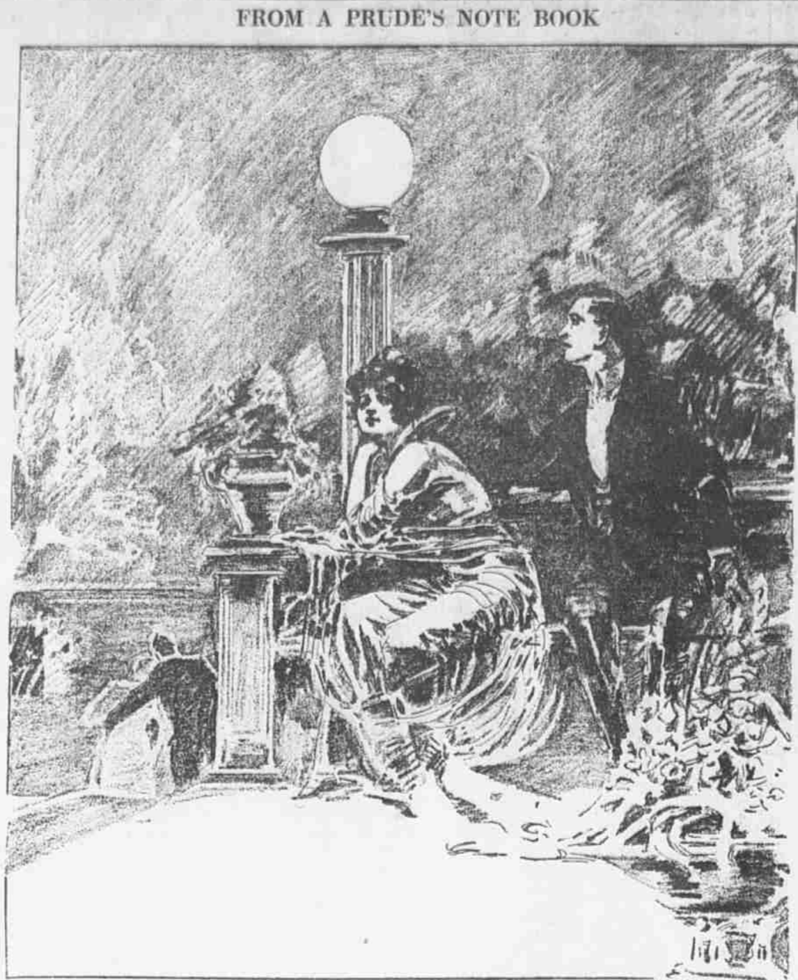
THE 1914 "MODEL" The wise virgin keeps the same old system—but puts faith in a 32-candlepower lamp.

The problem of the jealous wife takes various forms, and none of them is pleasing. The wife who is jealous of her husband's stenographer is to be encountered occasionally.