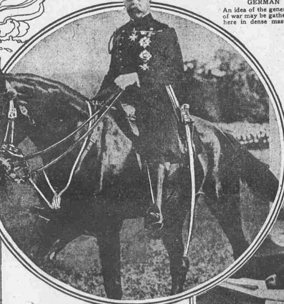
KING GEORGE GOES TO THE FIRING LINE