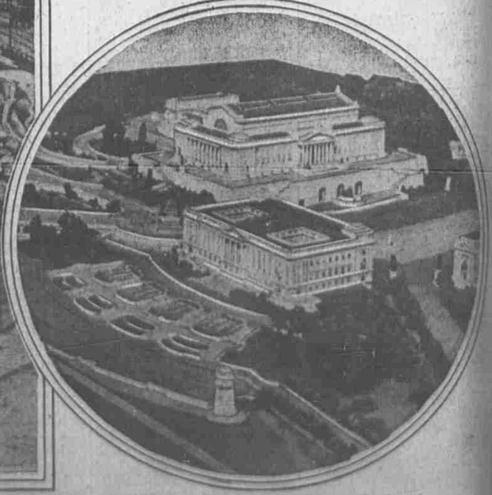
A PHILADELPHIA DREAM AND THE PROGRESS BEING MADE TOWARD ITS REALIZATION. On the left is shown the work so far accomplished toward leveling the site for the new Municipal Art Gallery to stand at the head of the Parkway when completed. This high hill at 7th and Spring Garden streets has made much tedious labor necessary. It is gradually being cut down a terrace at a time, despite lack of funds and needed appropriations. On the right is a model of the new building as it will look when completed. It will rise 50 feet into the air and will serve as a beautiful and dignified crown to the great thoroughfare that is to extend from City Hall. The site as it exists at present is not pretty to look at, but much time is necessary to effect the desired changes, and it is promised that things will look different a year hence.