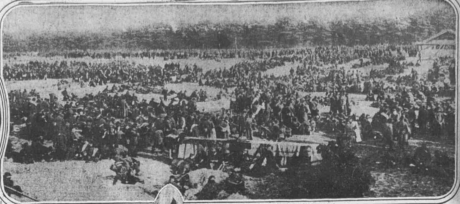
GERMAN PRISON CAMP THICK WITH PRISONERS. An idea of the general discomfort and overcrowding that is the lot of prisoners of war may be gathered from this photograph. The captured soldiers are shown here in dense masses with scarcely room to sleep in comfort or exercise.