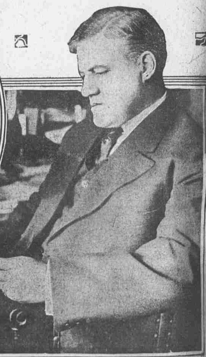
DECLINES PLACE IN WILSON CABINET. New photograph of Representative A. Mitchell Palmer, who is to be head dispenser of State patronage.