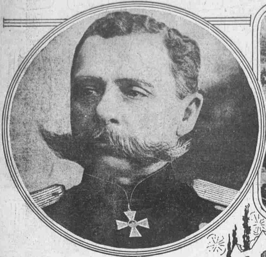
"FIRED" BY CZAR FOR BEING TWO DAYS' LATE. The portrait is that of General Rennenkamp.