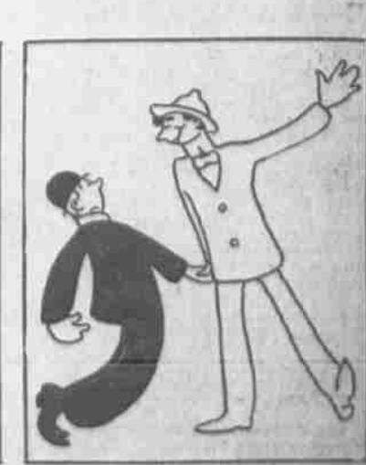
complianed thus: Grass your victim's hand, lerk it downward, pivot on one foot, and then with a full sweep of the arm slap him on the shoulder.