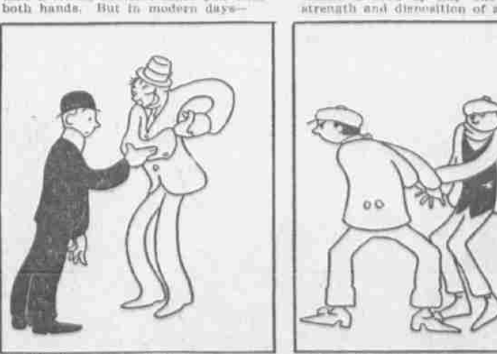
c. The "trut" hungshake is Larmiess. and is considered excellent exercise by those who indulge in it.