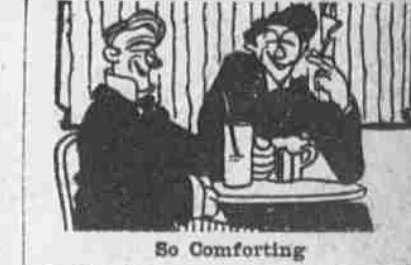
Dobbs-"So you send your wife for a Hobbs-"Yes; it's a great blessing."