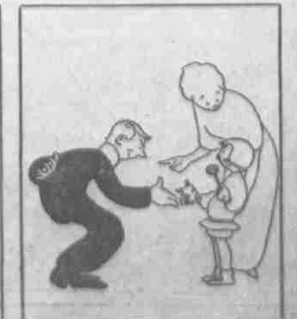
with polices then will the other purthe of that handshake,