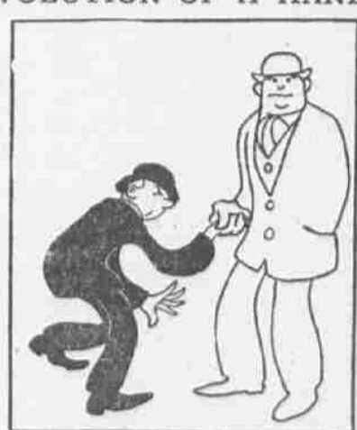
has deteriorated sadly. For example, we have the 'crusher' handshake, which is used by any one with the strength and disnesition of a bull