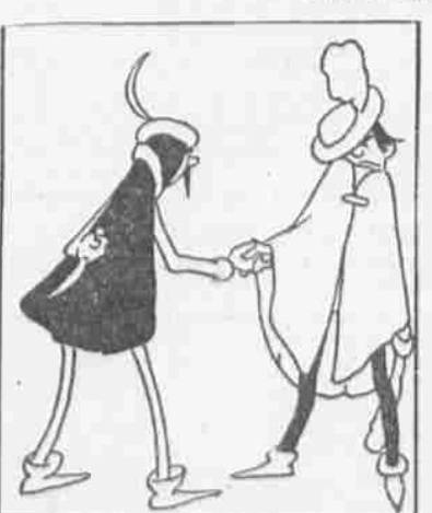
1. "Tis said the handshake originated in Italy in the olden days, where the people found it convenient to know that a friend couldn't knife you with