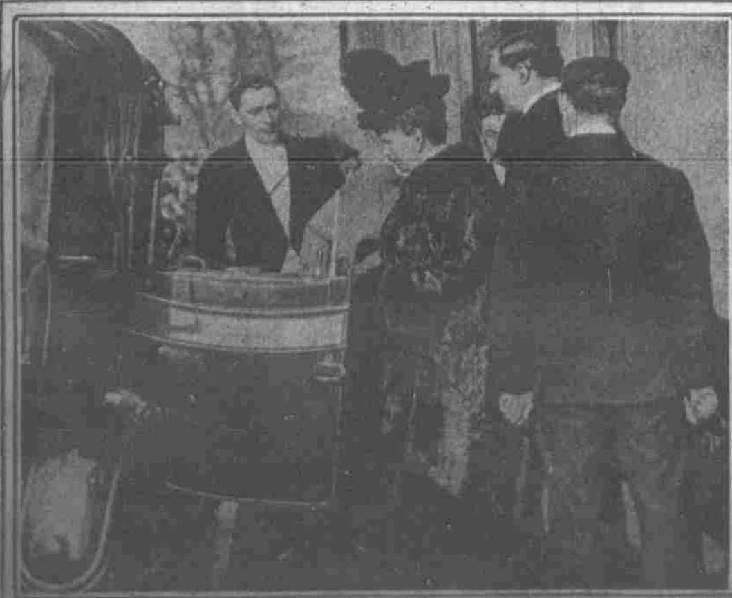
QUEEN MARY ON WAY TO VISIT AMERICAN HOSPITAL Queen Mary is shown as she arrived at Folkestone, England, where she visited the American Women's War Hospital. More than 400 wounded soldiers were being treated there at the time. She personally visited many of them and asked after their comfort and welfare.