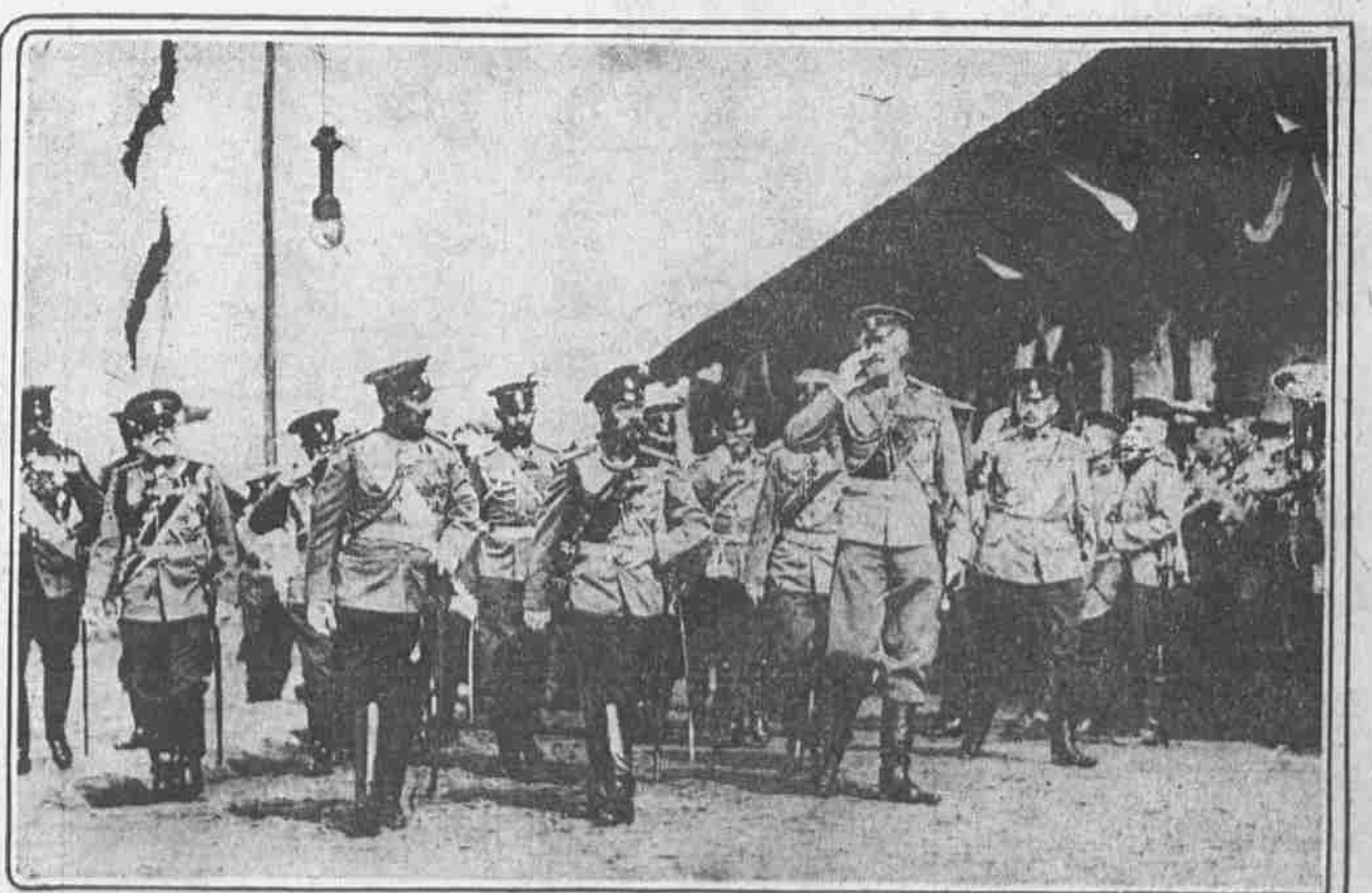
EMPERORS AT THE FRONT AGAIN, BUT NO LONGER TOGETHER This picture of the Kaiser and the Czar side by side is peculiarly interesting just now because both Emperors are reported to be observing the movements of their troops on the Russian frontier, though, needless to say, they are not now chatting gaily as they are in this scene. Grand Duke Nicholas is on the right.