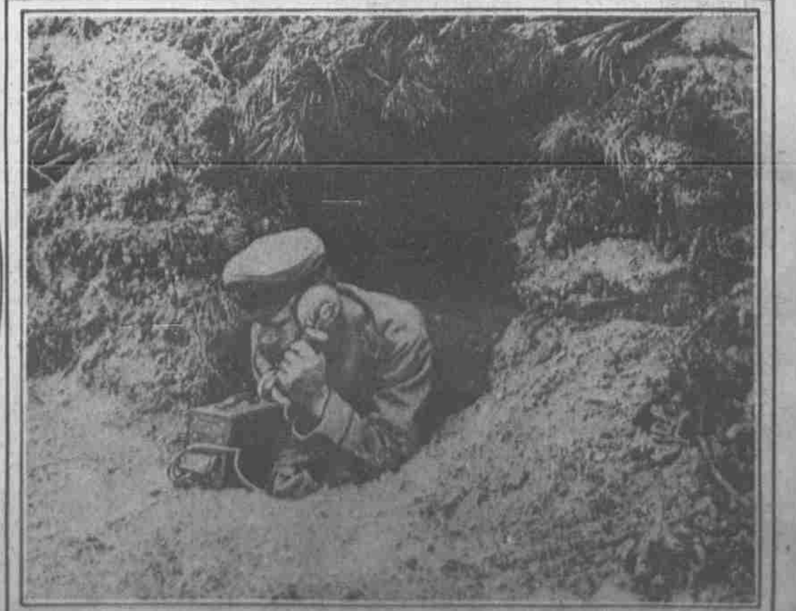
GERMAN OFFICER TELEPHONING FROM A DUGOUT NEAR VERDUN This picture reveals the completeness of the casemates that have been built by the opposing armies in the months of fighting. They have taken place around the great fort-rue in eastern France. The straw chair, shown on top, keeps out the rain and snow.