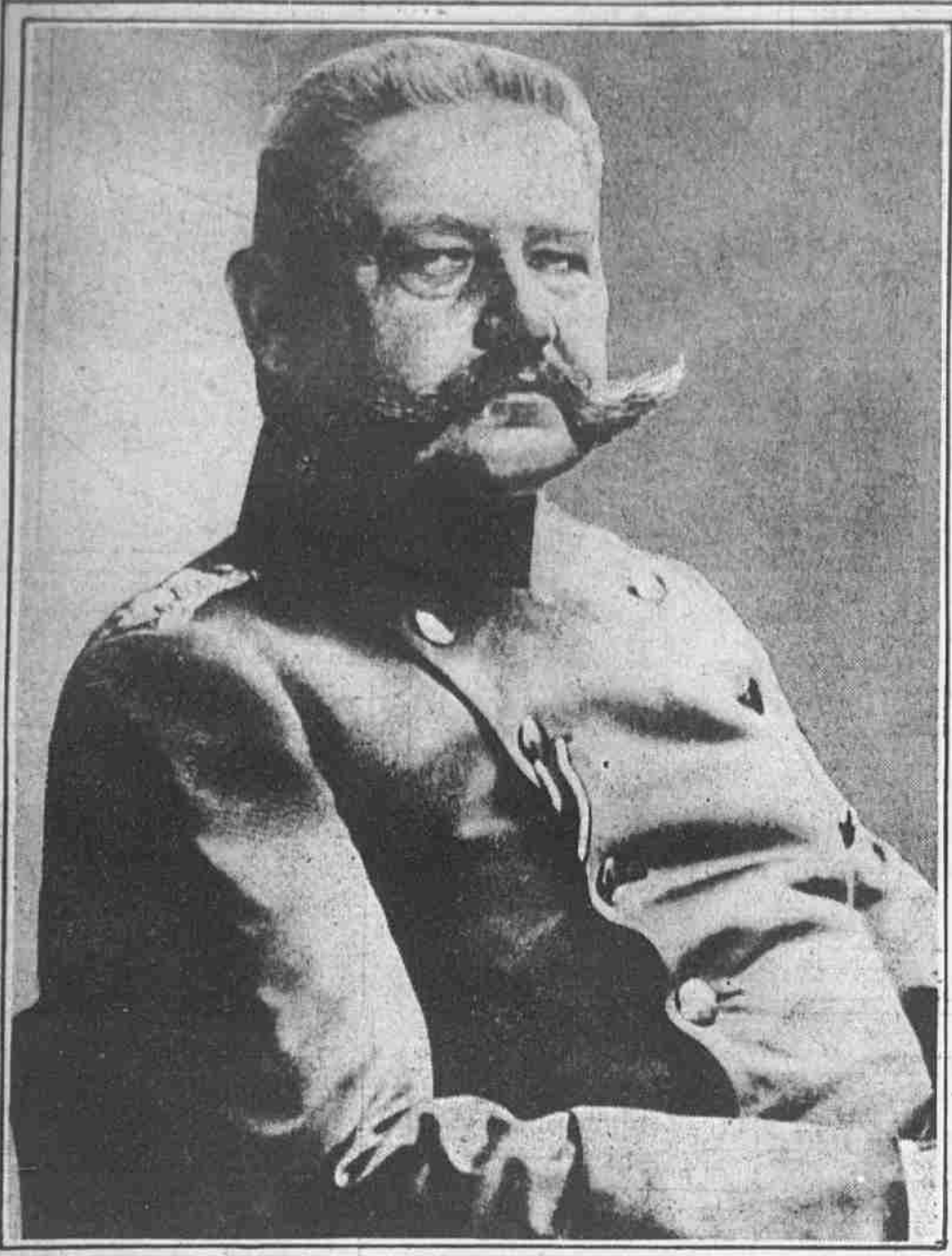
GENERAL VON HINDENBURG, THE LION OF GERMANY His face is a war map in itself. This portrait of the newly created Field Marshal has just been received in this country. His defense of the East Prussian frontier has made him a hero in the eyes of the German people. His name is heard everywhere.

PERSONS AND EVENTS IN THE NEWS OF THE DAY AS PORTRAYED BY THE QUICK EYE OF THE CAMERA