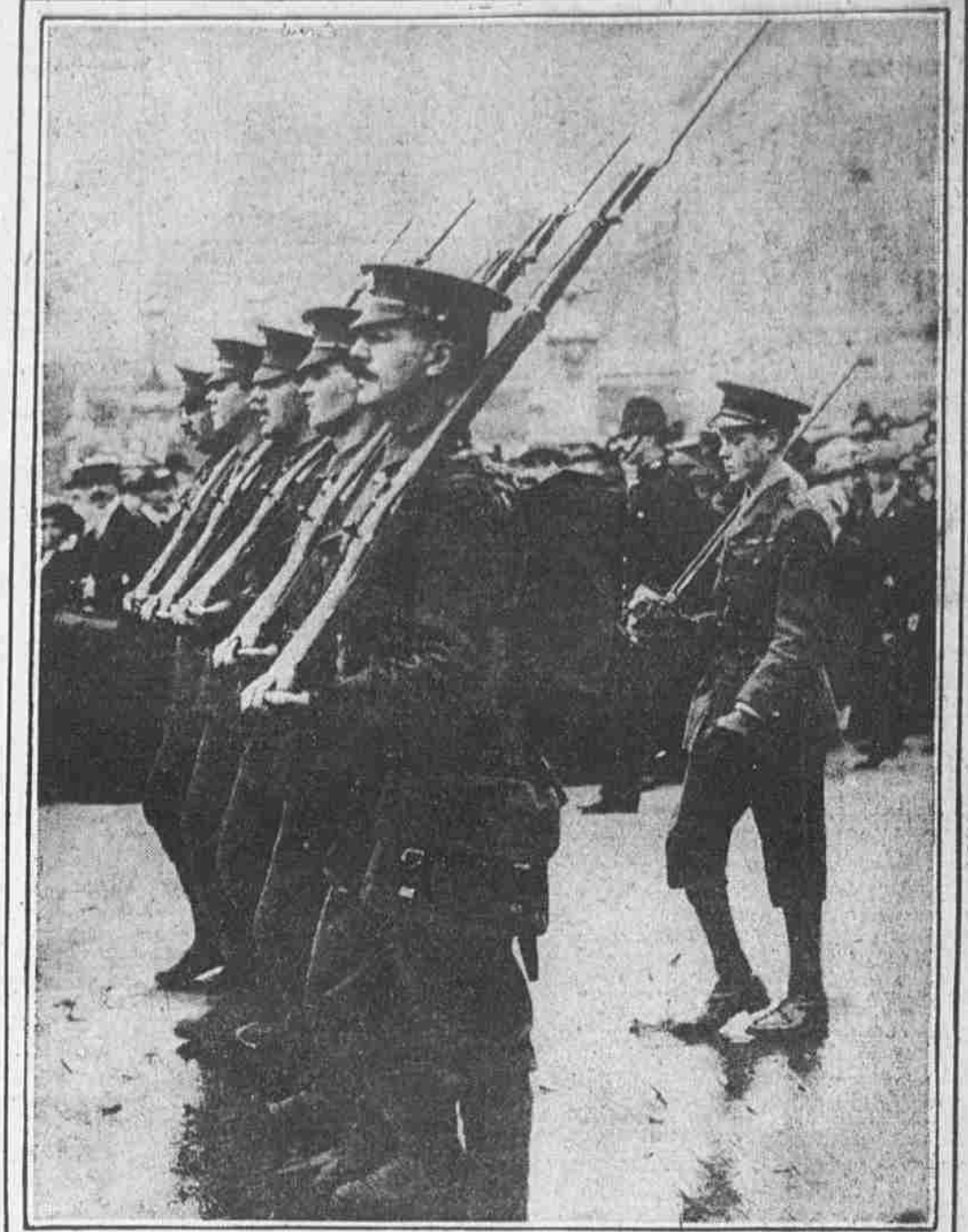
PRINCE OF WALES OFF TO THE FRONT The dearest wish of the Prince of Wales, to go to the battle line, has been granted. The photo shows him, at right, as he appeared on his way to join the expeditionary forces. He is not exactly a sturdy young man, as is plainly shown in the photograph.