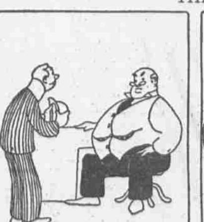
"Mr. Thomskins, I am a struggling young man. As one of the city's prominent millionaires, won't you give me some advice from your ex-periences on the road to wealth?"

"As a young man I would never smoke or drink. Those are habits that never get you anywhere.