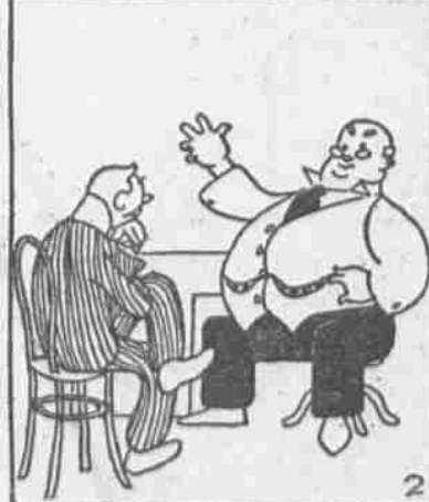
"Why, my dear boy, I should be delighted. If only more young men would follow my example, they, too, might achieve the success that has come to me.