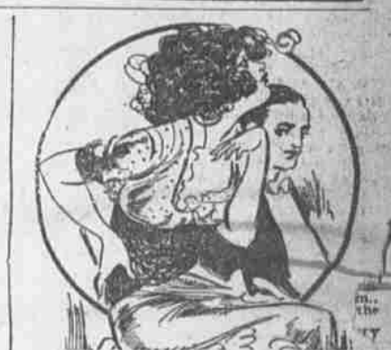
Summing Him Up Percy-Have you ever loved before? Mercy-No, dear: I have often admired men for their strength, courage, beauty, intelligence or something like that, but with you it is all love-nothing else!