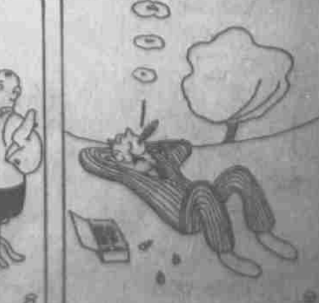
"And here I am the product of in-