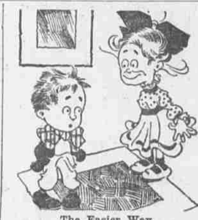
The Easier Way "After I wash my face I look in the mirror to see if it's clean. Don't you?" "I don't have to. I just look at the towel."