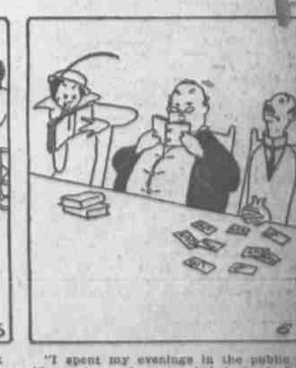
"I spent my evenings in the public library improving my mind, instead of wasting my leisure bours in frivolous