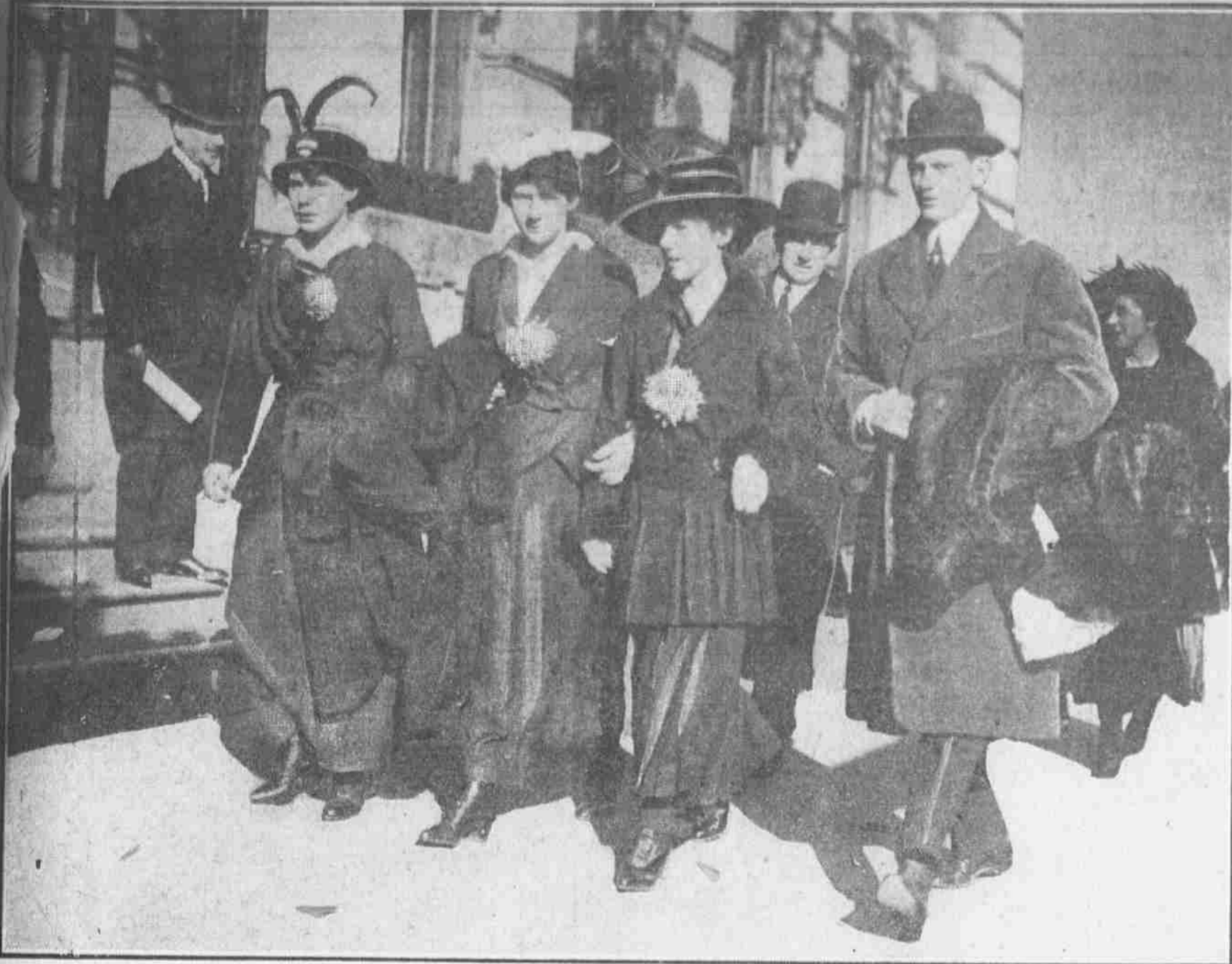
STARTING FOR THE GAME, CHRYSANTHEMUMS IN PLACE

Feminine football enthusiasts in their newest and best winter clothes held possession of the streets today. Many were visitors from Washington, Baltimore and New York.