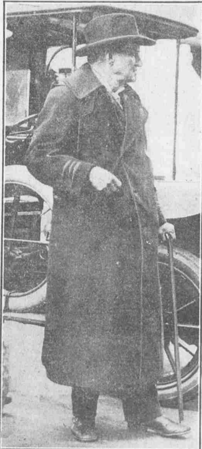
SENATOR TILLMAN A ROOTER, TOO

Street salesmen, bearing flags and banners with the Navy blue and the Army gray, lined the avenues to Franklin Field, their forests of canes and pennants helping to add to the day's color scheme.