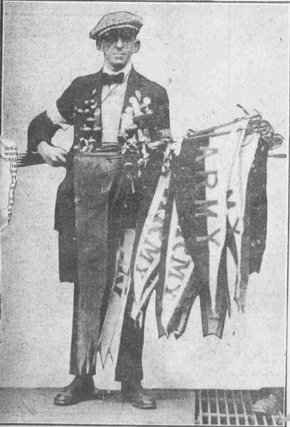
"HERE YAR, ARMY 'N' NAVY PENNANTS!"

Feminine football enthusiasts in their newest and best winter clothes held possession of the streets today. Many were visitors from Washington, Baltimore and New York.