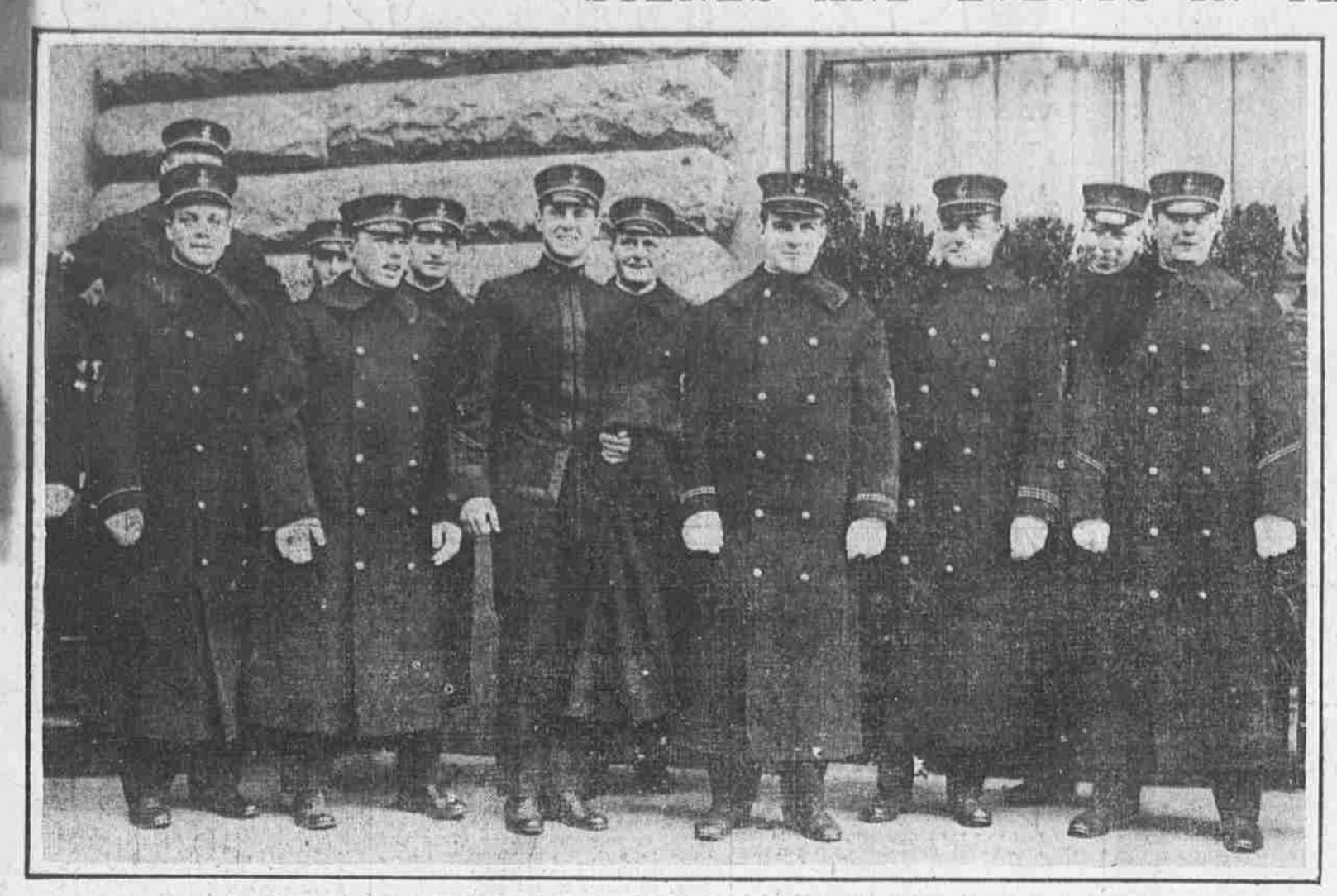
NAVY TEAM IN CADET UNIFORMS KINDLY POSE IN FRONT OF THEIR HOTEL.

SCENES AND EVENTS IN THE NEWS OF THE DAY