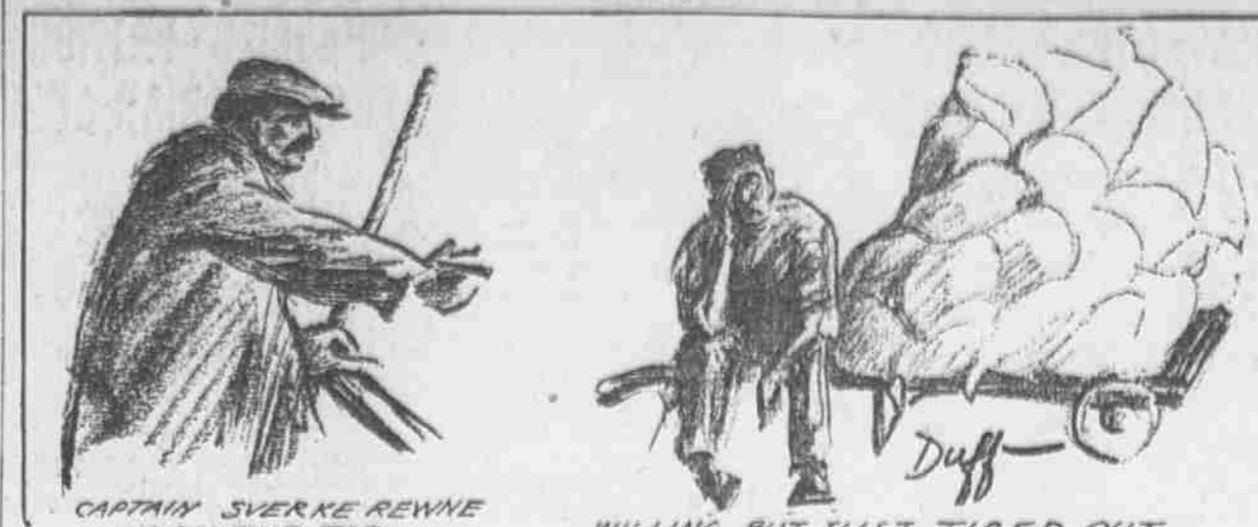
CAPTAIN SVERKE REWNE IS ON THE JOB WILLING BUT JUST TIRED OUT