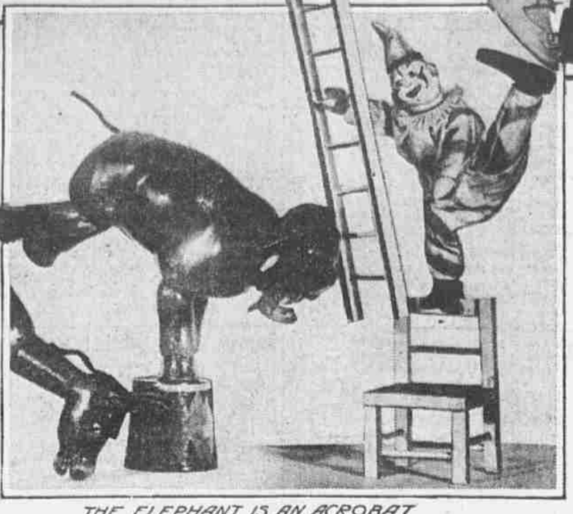
THE ELEPHANT IS AN ACROBAT