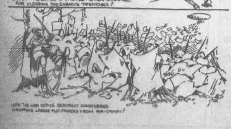
HAS THE WAR OFFICE SERIOUSLY CONSIDERED DROPPING LARGE FLY-PAPERS FROM AIR-CRAFT?