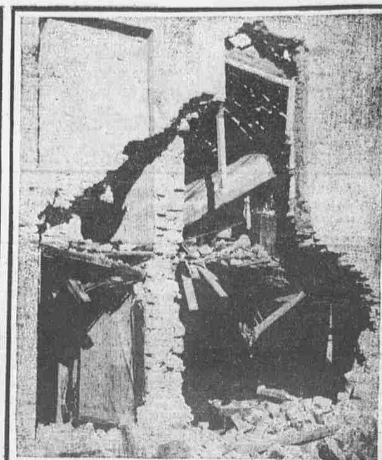
ON THE WEST BANK OF THE YSER Effects of the terrible struggle that has been raging on the Yser River, in northwest Belgium, between the Germans and the Allies. One shell ripped the side out of this huge building.