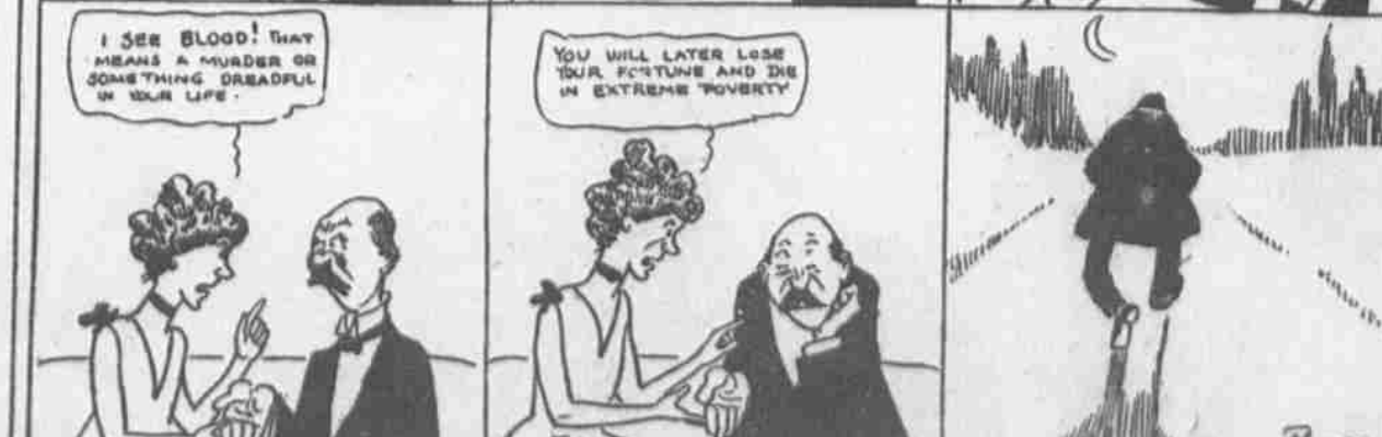
I SEE BLOOD! THAT MEANS A MURDER OR SOMETHING DREADFUL IN YOUR LIFE!