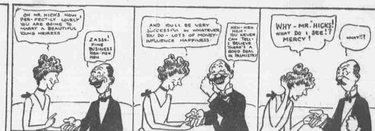
OH MR. HICKS HOW PERFECTLY LOVELY YOU ARE GOING TO MARRY A BEAUTIFUL YOUNG HEIRESS