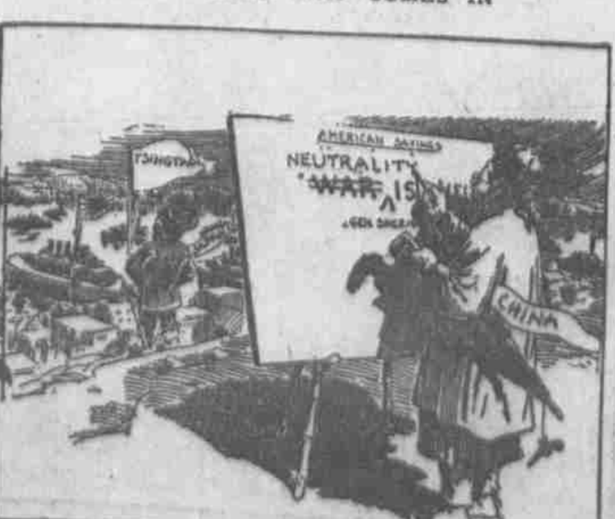
AN ORIENTAL REVISION

MORE SURPRISES FOR THE GERMANS —From London Sketch. An English comic-artist comes forward with suggestions for repelling Teutonic assaults. He has evidently been stimulated by the Kaiser's own war novelties like the great and famous 42-centimetre siege gun.