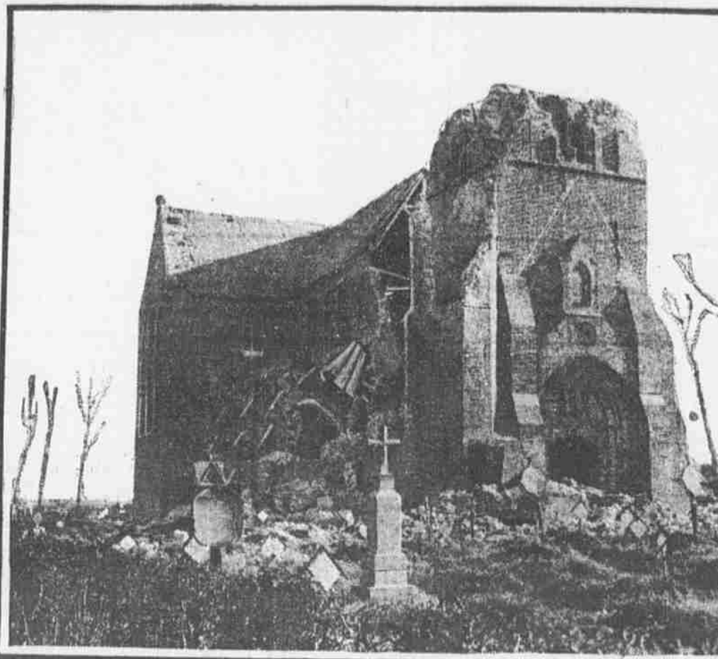
NIEUPORT'S 'MINSTER' AS IT LOOKS TODAY This famous old church, a landmark for centuries, quickly crumbled in the desperate artillery battles that centred around the head of the Yser Canal when the Germans strove to push down the Belgian coast to Dunkirk and other French ports.