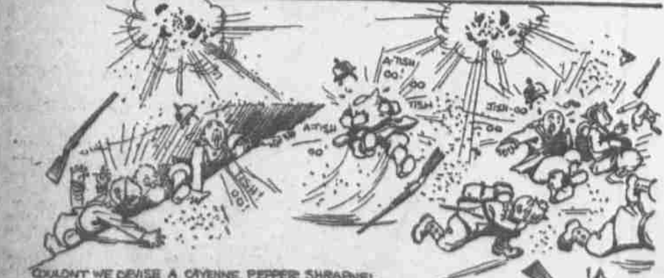
COULDN'T WE DEVISE A CRYOLINE PEPPER SHRAPNEL FOR CLEARING THE ENEMY'S TRENCHES?