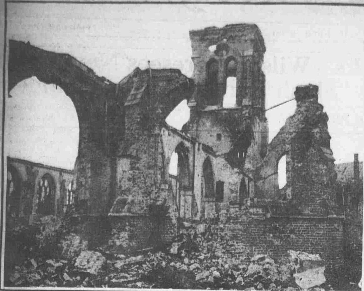
BELGIAN CHURCH AFTER 2000 SHELLS FELL IN YARD Little was left of the old church in the Flanders village of Peroyse after it had borne its share of 12 bombardments suffered in three weeks. Artillery fire sometimes plays freakish tricks, as in this case, where most of the tower is standing.