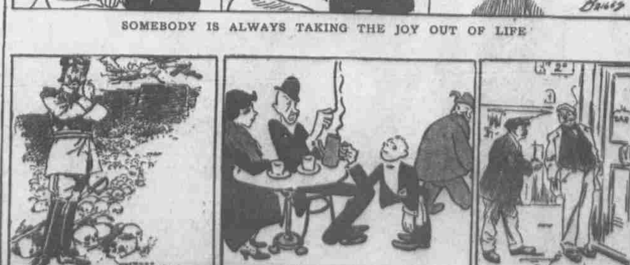
THE MISSING ALLY