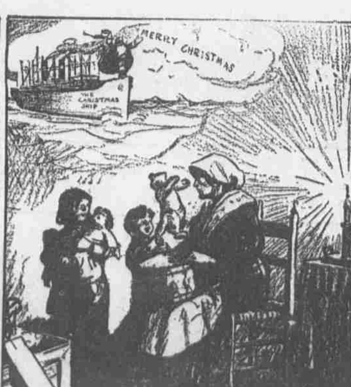
WHEN THEIR SHIP COMES IN