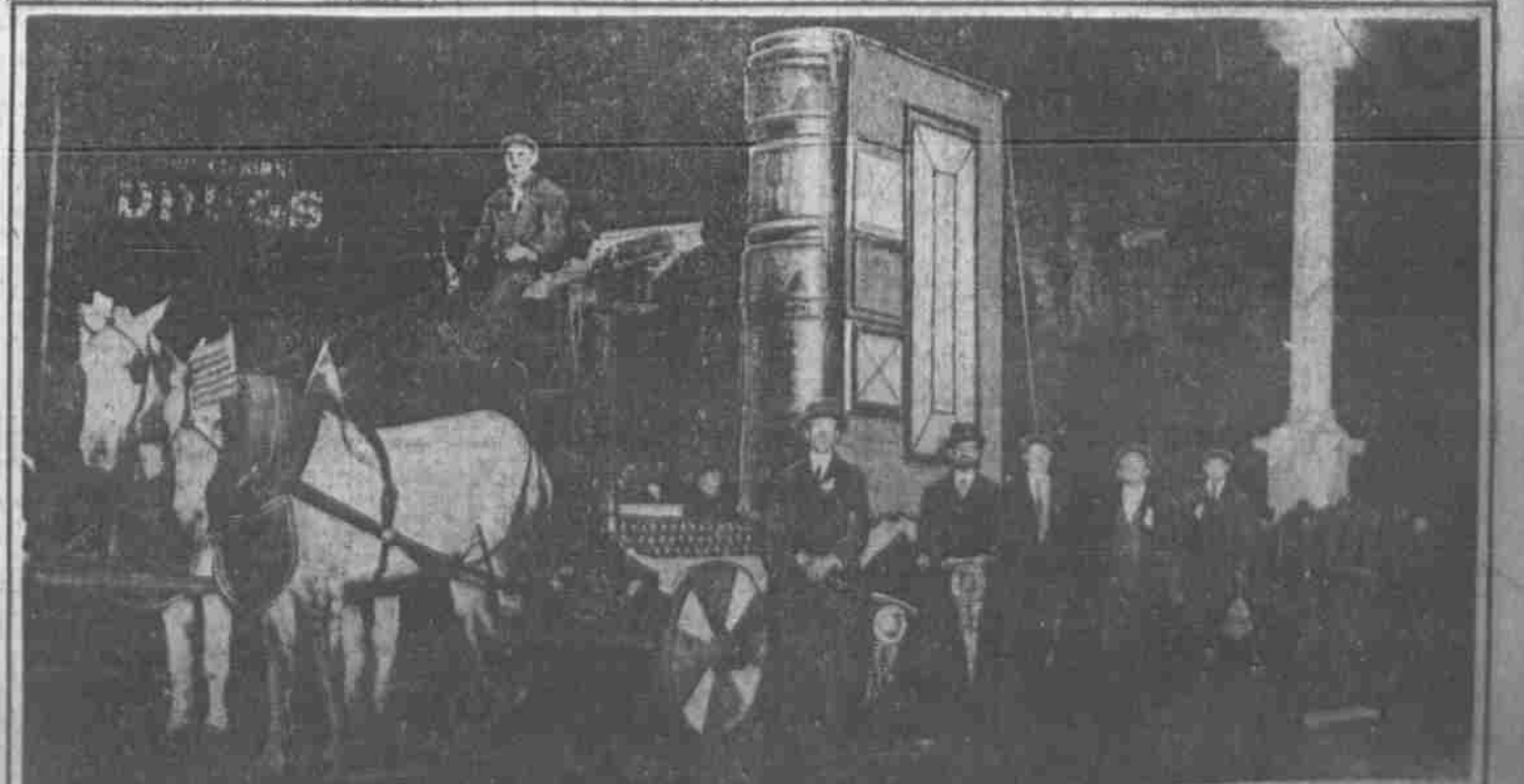
BIGGEST BOOK IN THE WORLD IN THE LABOR PARADE

The wreck of the British hospital ship Rohilla, breaking up on the rocks off Whitby, England, early in November.