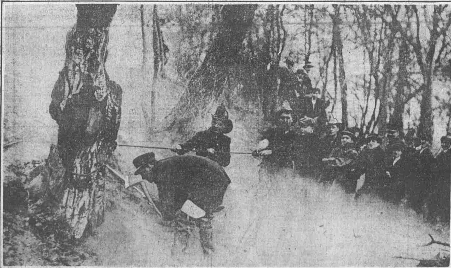
FIGHTING A FOREST FIRE IN WEST PHILADELPHIA

They are shown standing in midfield, surveying the scene of the Yale-Princeton battle today, while Princeton students, seated in the amphitheatre, are trying out new songs and cheers.