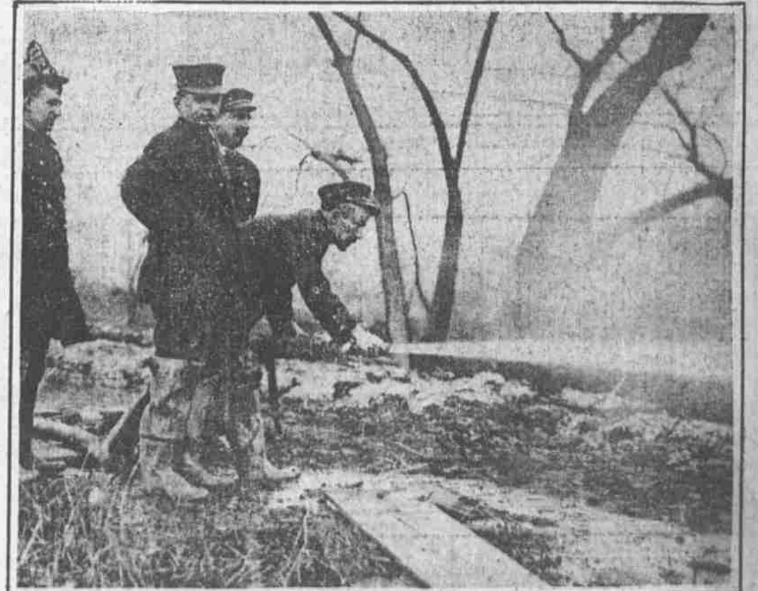
DELUGING THE EMBERS IN CITY FOREST FIRE

Firemen at 60th street and Lancaster avenue pulling down a blazing tree to stop the progress of the flames. The long drought has caused many forest fires in New Jersey, New York and Pennsylvania, and the fire in West Philadelphia yesterday was a miniature example of the general condition.