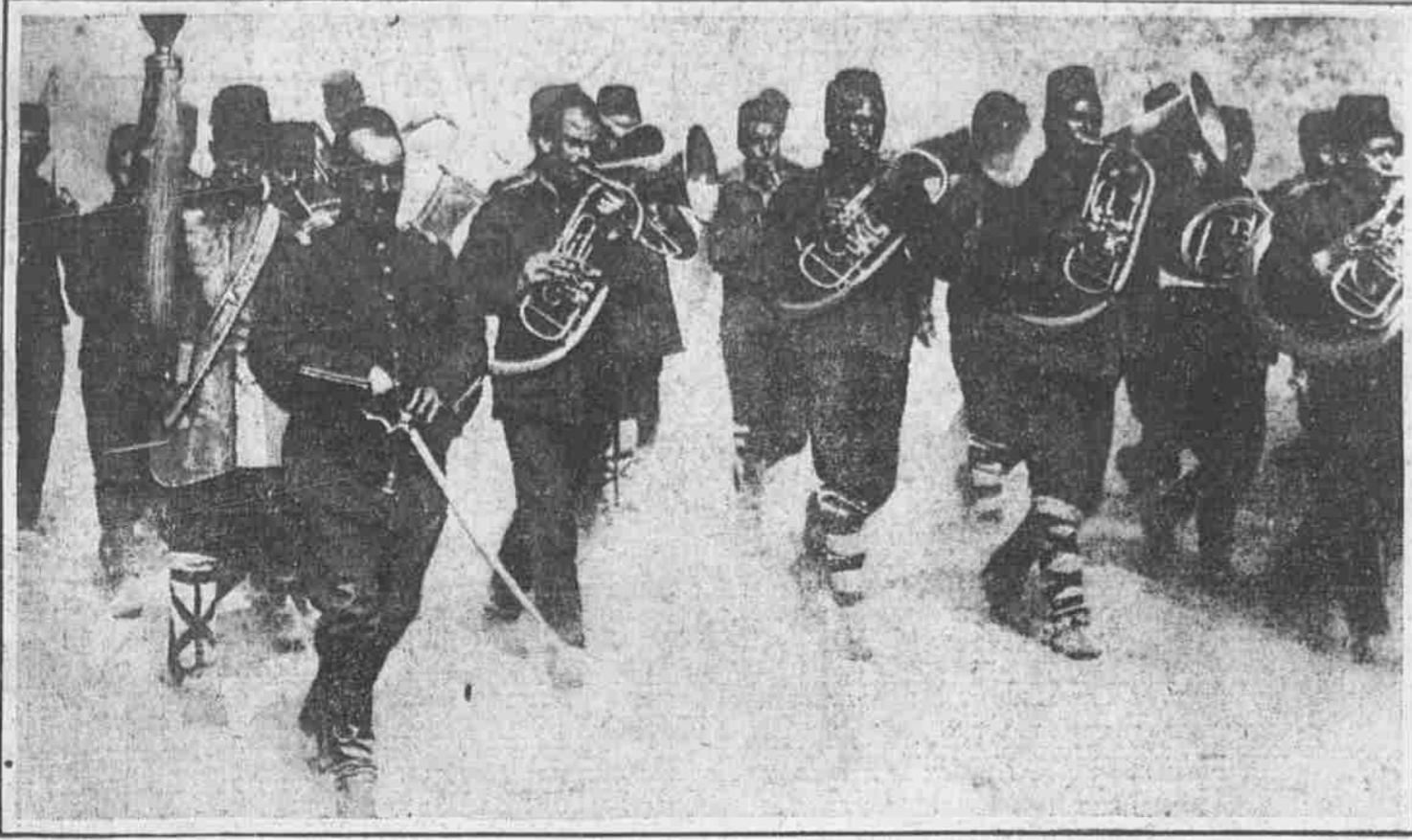
WHEN THE SULTAN GOES FORTH TO WAR Turkey's new army has an exceptional number of military bands to the corps. Here one is shown leading its regiment through the streets of Constantinople.

SCENES AND EVENTS IN THE NEWS OF THE DAY