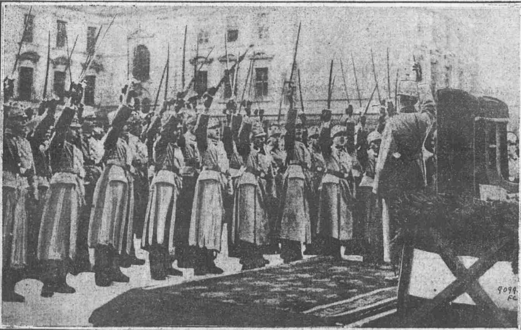
AUSTRIAN SOLDIERS CHEER THEIR EMPEROR Vowing to fight, and die if need be, in the defense of their Fatherland. The ceremony of administering the oath of service to troops bound for the front is observed amid stirring scenes in Vienna.