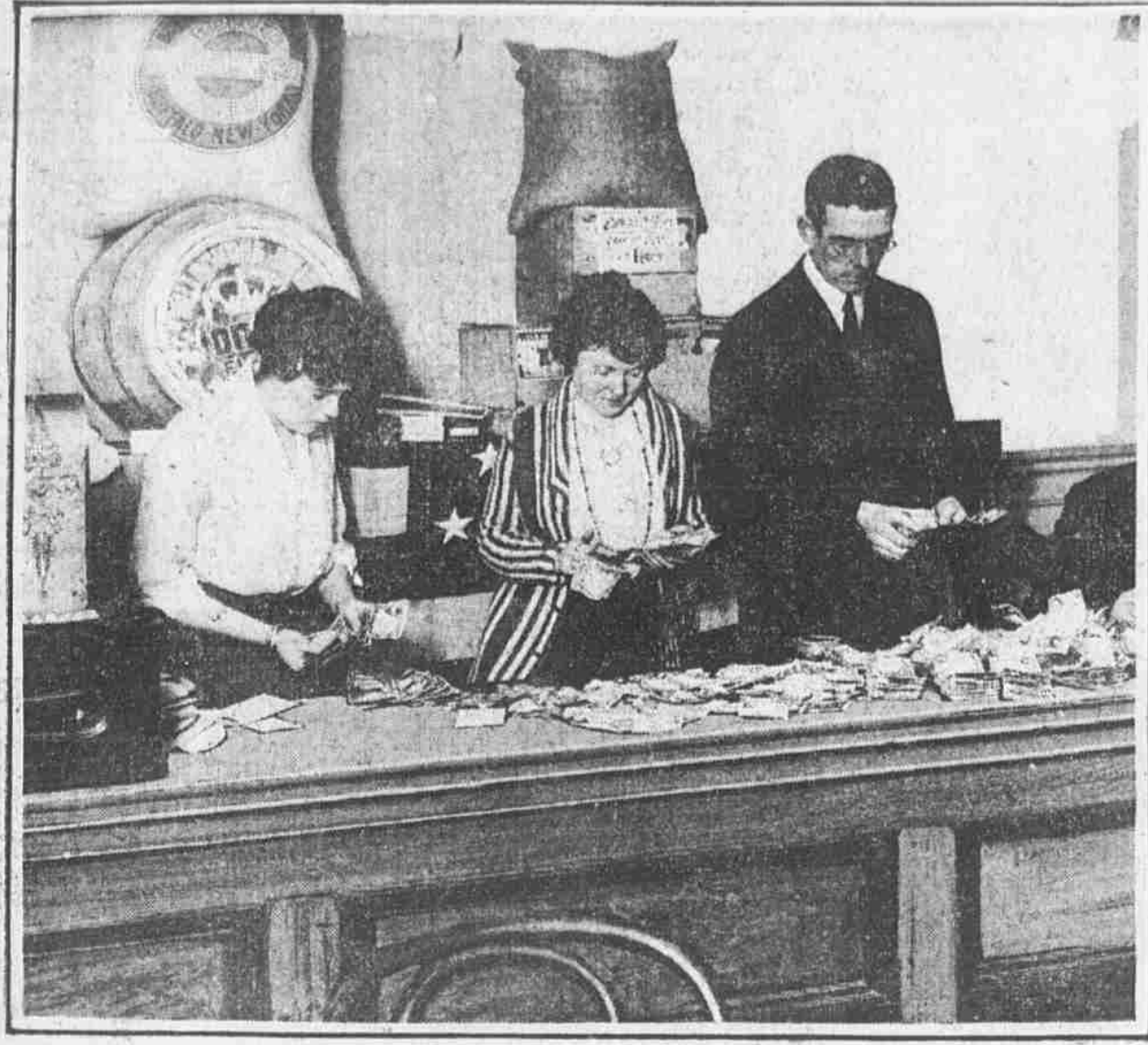
COUNTING THE MONEY FOR BELGIANS' RELIEF At the headquarters of the committee in the Lincoln Building. Nearly $10,000 was contributed yesterday and handled at this counter, bringing the total to $135,000.

AT HOME AND ABROAD IN THE WORLD OF NEWS WITH THE CAMERA