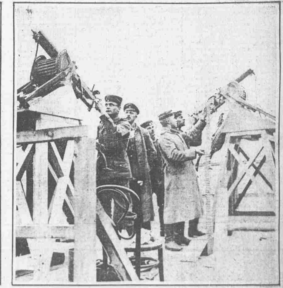
READY FOR FRENCH SCOUTS OF THE AIR German machine guns in position in Belgium. The Germans are reported to have improved greatly in their aim and the Allies' airmen have become more wary,