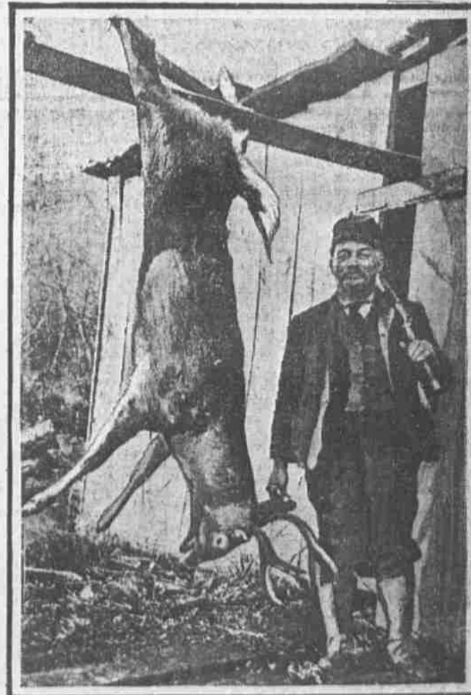
A FULTON COUNTY HUNTER

Some of the best deer hunting on the continent is found in this section of Pennsylvania. Two hunters and their wives are shown at their temporary home, with a youthful neighbor who brought down one of the animals.