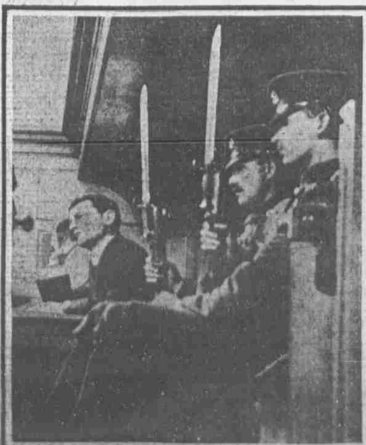
GERMAN SPY, WHO WAS SHOT, ON TRIAL

battery moving across the plains of Shantung, drawn by the little but energetic Japanese horses.