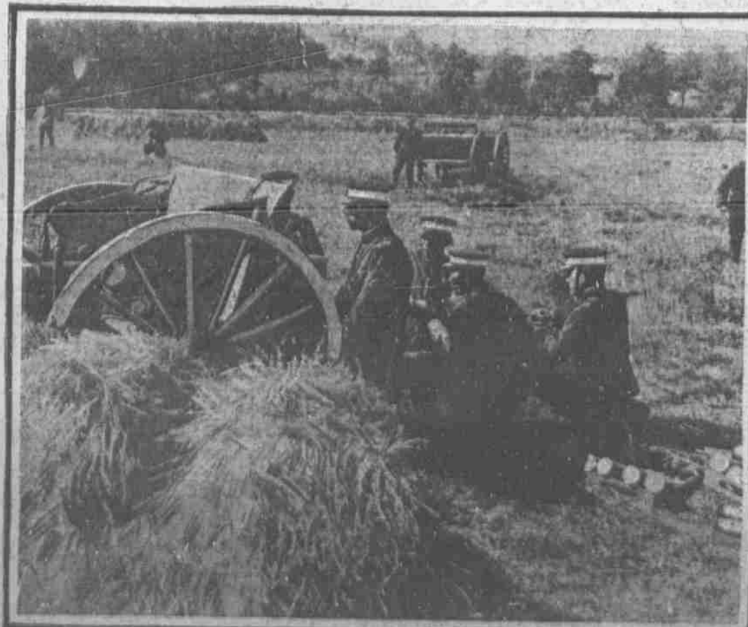
JAPANESE ARTILLERY ON WAY TO TSING-TAO

He has just brought in his quarry and hung it up for his son to skin, while he hastens back to the hunt.