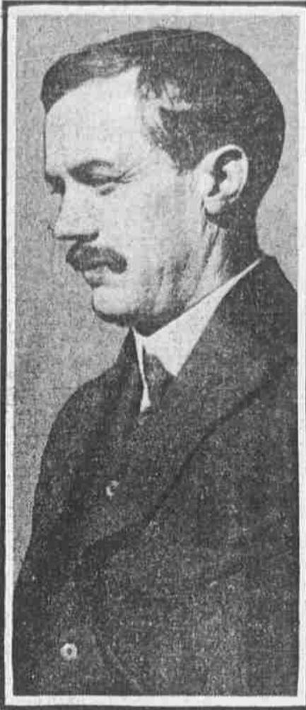
THE THELMA'S COMMANDER

This morning found the workers at the foot of Dock street putting every energy into the task of getting off the Belgian relief ship at earliest possible moment.