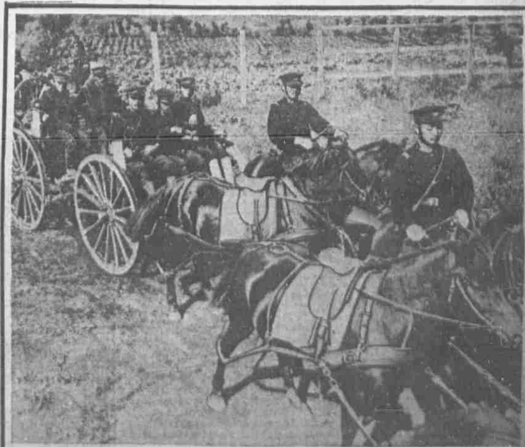
JAPS SHELLING TSING-TAO

Carl Lody before a British court-martial. He was executed in the Tower of London.