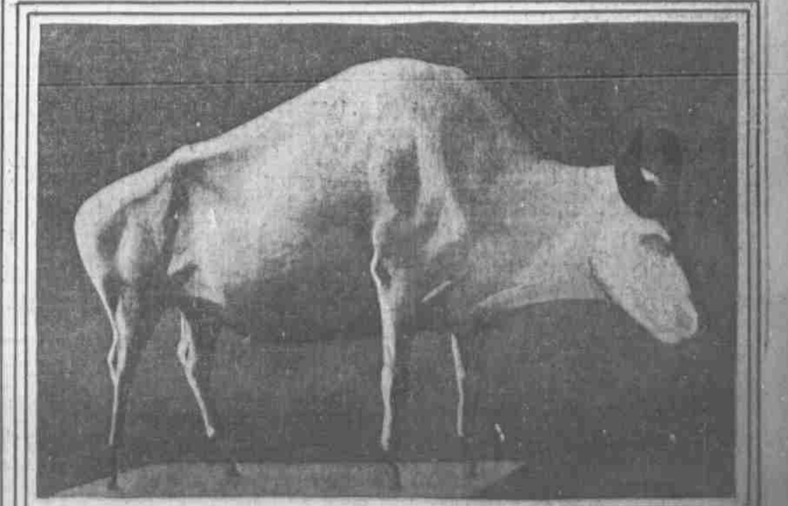
PLASTER CAST OF LAST OF CENTENNIAL HERD. Buffalo's hide will be stretched around this, making life-like representation.