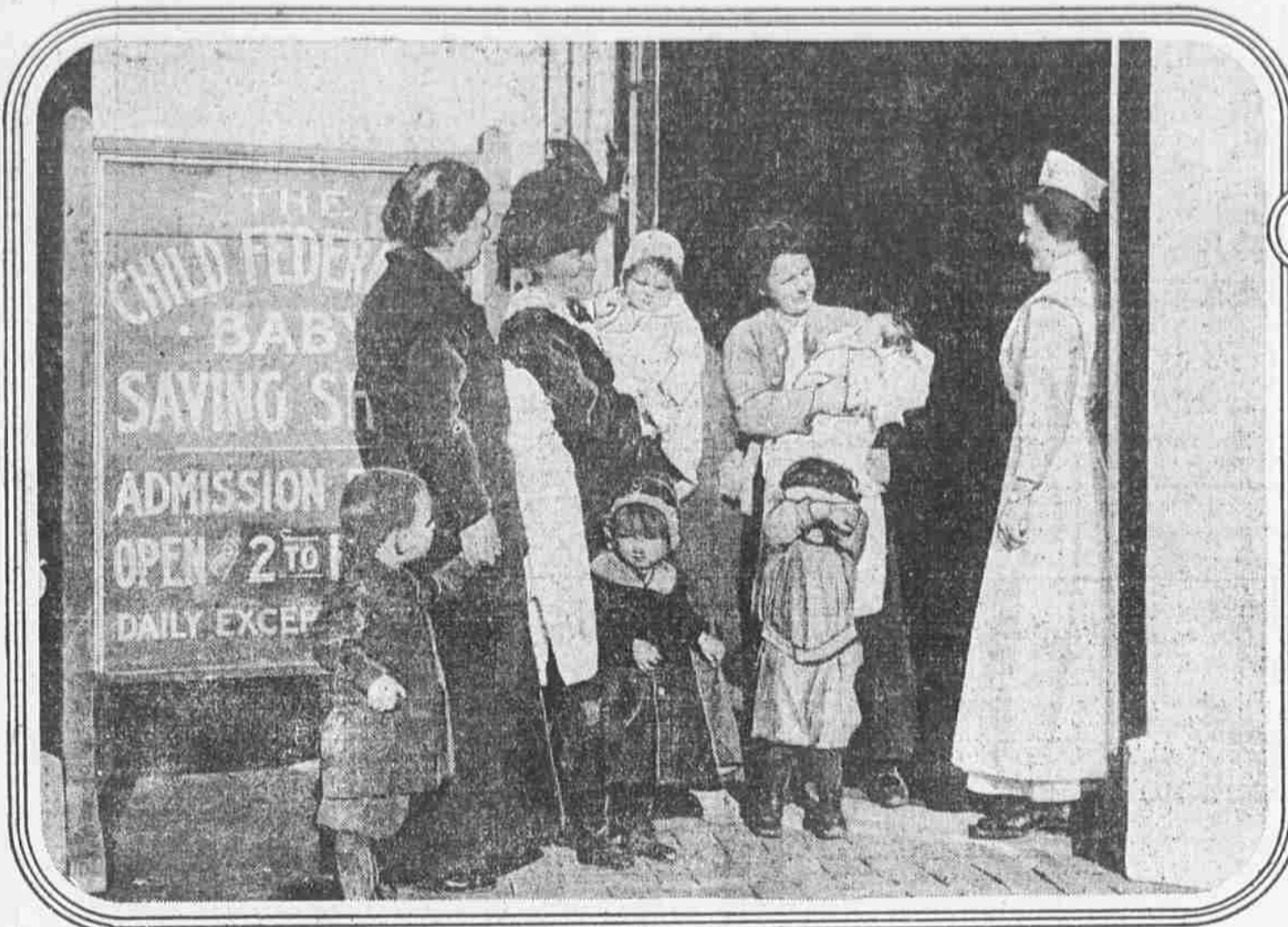
TEACHING PROPER CARE OF CITY'S YOUNGSTERS Mothers with babies in their arms flock to Temple University to attend Child Federation clinic.