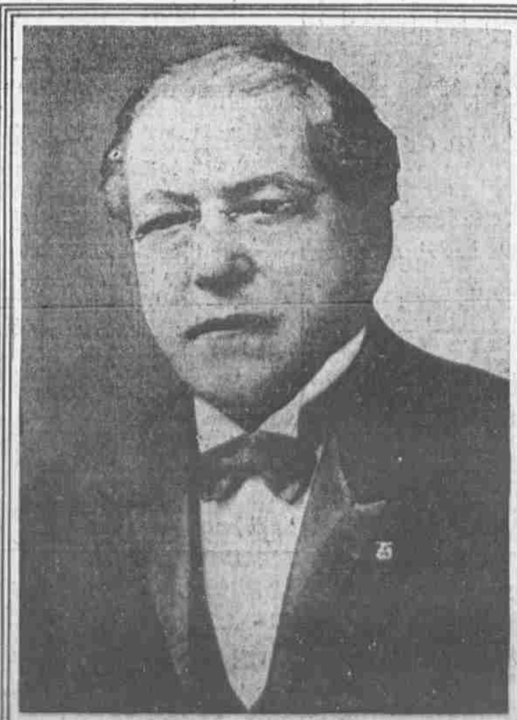
SAMUEL GOMPERS—President. DELEGATES TO A. F. OF L. CONVENTION, WHICH OPENS HERE MONDAY