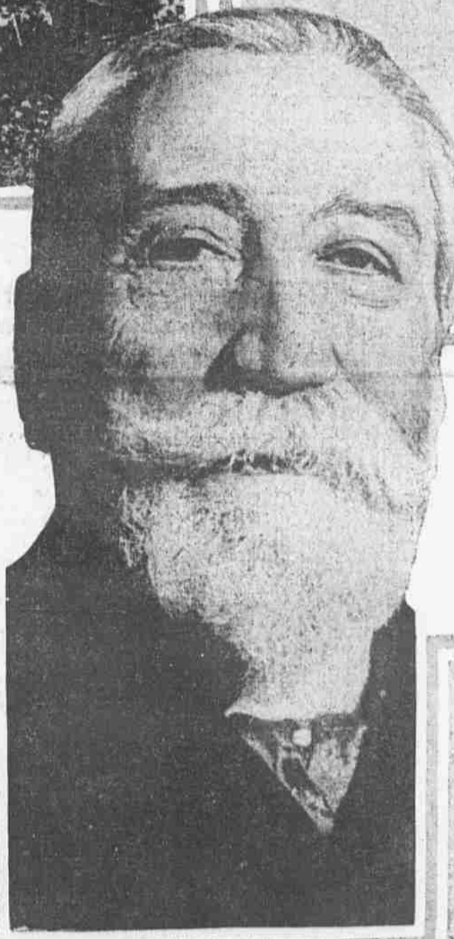
Anatole France, noted author, who does not believe his 70 years disqualify him from service in French army.