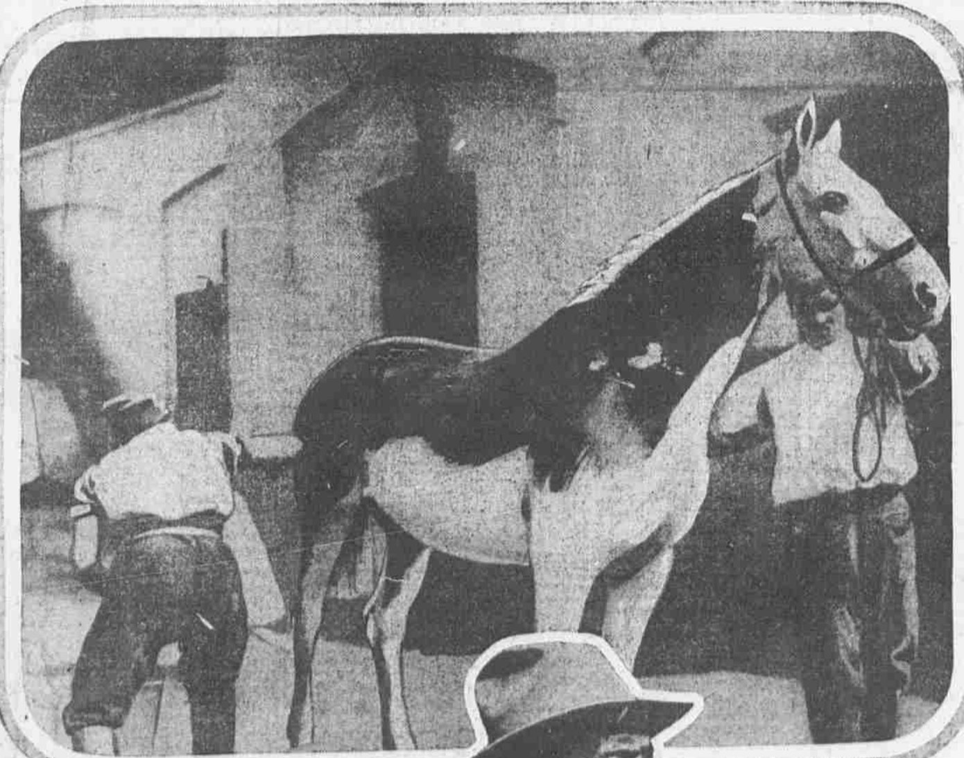
German soldiers painting a white horse khaki. Its white coat would make it a good target.