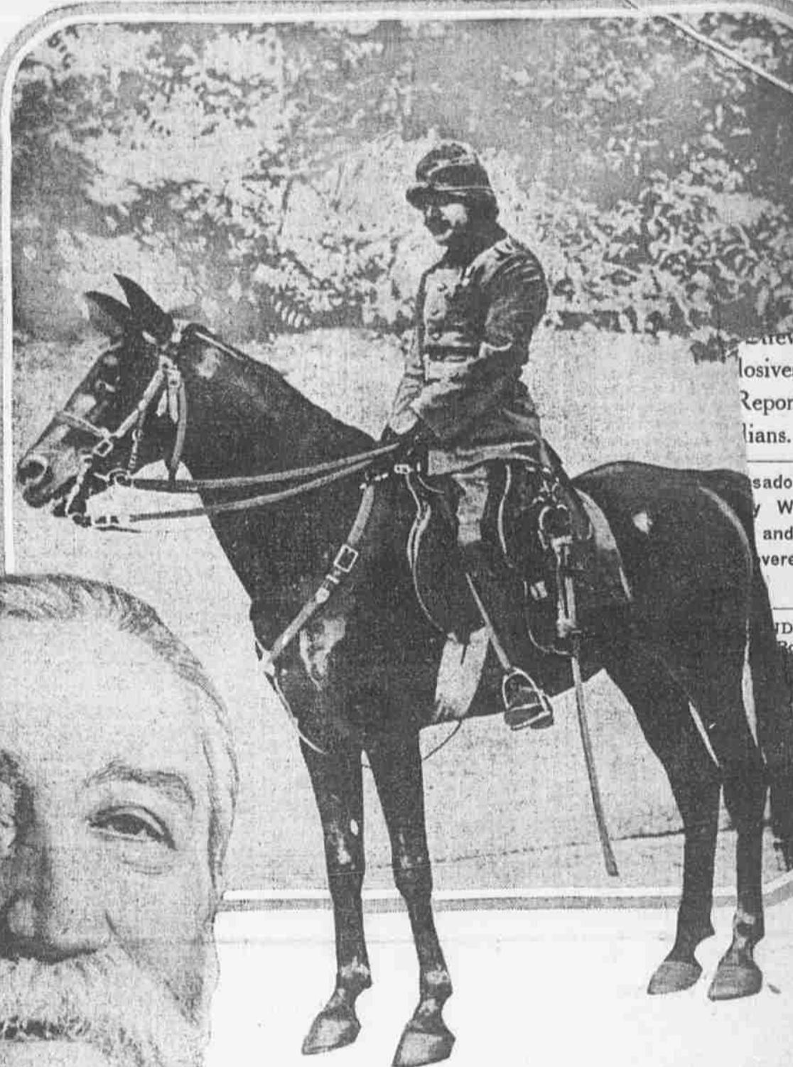
Enver Pasha, Turkey's War Minister, reviewing mobilized army. His influence is believed to have plunged Turkey into war against Russia.