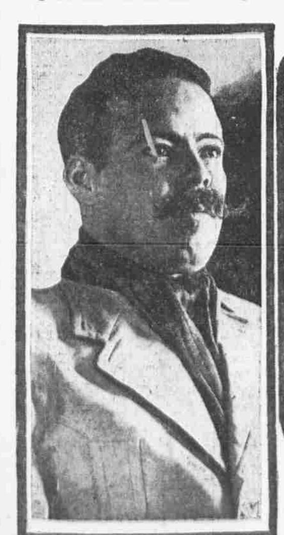
tionary Leader, who Will Take Active Part if Country Is Plunged Again Into Civil Strife,