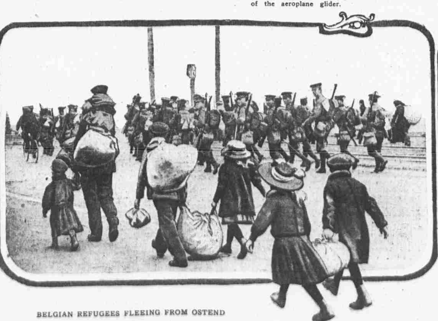
Alarmed by the onward rush of the Germans from Antwerp, the inhabitants sought ships to carry them to safety. British troops are shown serving as an escort.