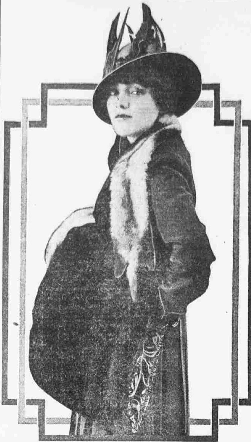
FITCH COMBINED WITH SEAL MAKES AN ATTRACTIVE SET

The care of the finger-nails is a most important consideration. They show a lack of care remarkably soon. And few people can help but misjudge the owner of ill-kept nails either man or woman.