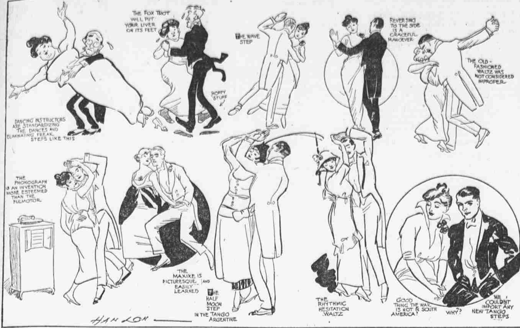
Terpsichorean distortions, however, are being shunned by those who love dancing for the sake, and only grace and beauty. Adopt modern steps because of their...