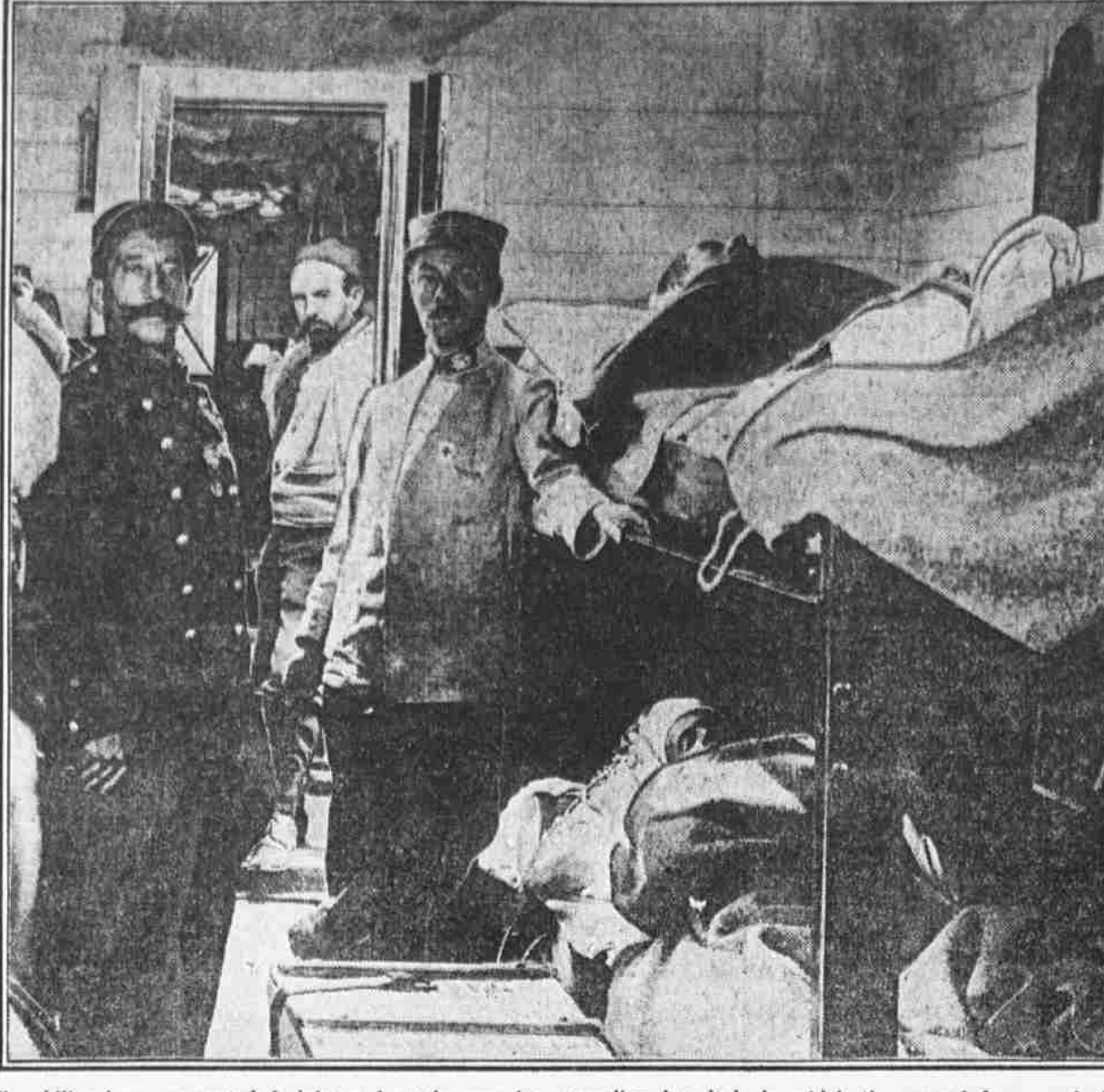
The Allies have converted freight and cattle cars into traveling hospitals in which the wounded are rushed to