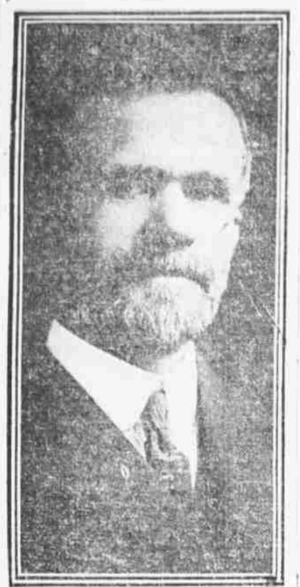
PROFESSOR WALTER RAUCHENBUSCH

Rauchenbusch Now Writes to Prove the Vitality of Christianity in Its Fight With Modern Evils.