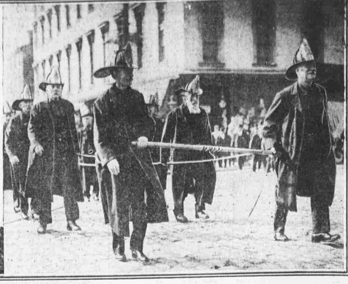
VOLUNTEER FIREMEN, WITH "NEPTUNE," OFF TO CONVENTION AT HARRISBURG