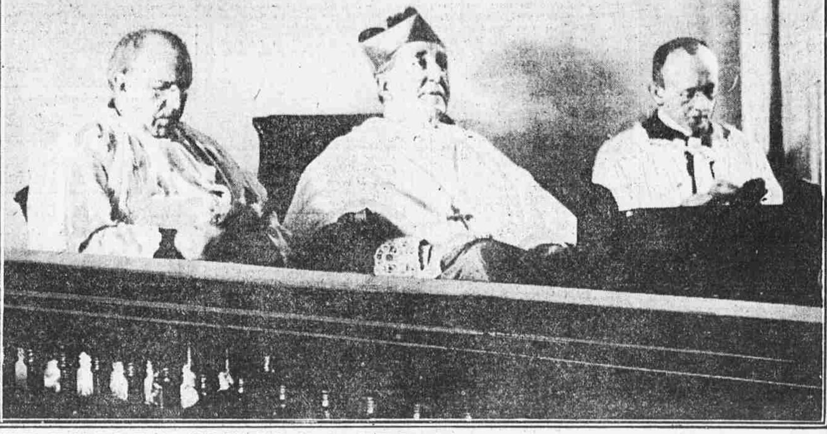
ARCHBISHOP PRENDERGAST AT CELEBRATION OF ST. JOSEPH'S ASYLUM