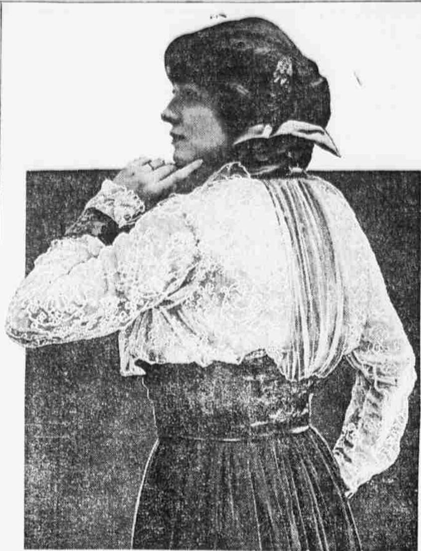
BLOUSE OF LACE OVER CHIFFON

The scene is set in a large, well-lighted office. My second night in Philadelphia I felt so sad, and then a kindly thing occurred to cheer me on my lonely, quiet way. Outside the moving-picture house I had seen that lovely play called "Hearts Adrift." I was accented by a cheery, Irish girl. "Give what, there, kid? Ain't you the little knockout who didn't understand the working of the phone up in our office?"