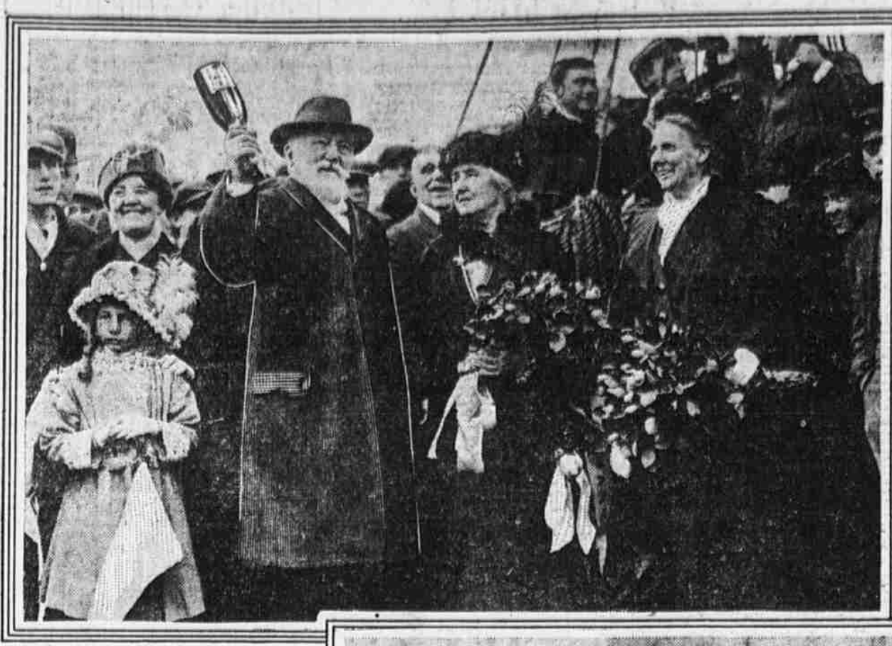
MAYOR BLANKENBURG CHRISTENING THE SUFFRAGE BALLOON