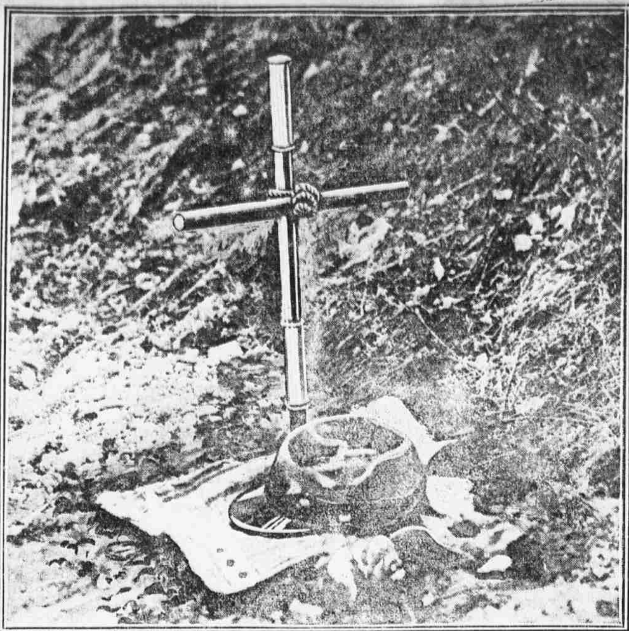
SILENT TRAGEDY OF THE BATTLEFIELDS OF THE MARNE French soldiers are buried where they fall. A cross marks their graves. The crosses are made of the handles of mess tins and the dead man's cap and scarf are placed on top of the mound.

ROTTERDAM, Sept. 28. A Dutchman who has just returned from Aix-la-Chapelle gives a thrilling story of an exciting three-cornered duel in mid-air fought a few days ago by the occupants of three airships—German, English and French. The story was related to him by the German officer, who narrowly escaped death after an experience which he does not desire repeated. "Some days ago," this officer said, "I was instructed to do some important reconnoitering in the northern district of France, especially near Lille and Maaubeuge. I left Belgium in my Taube biplane with a mechanic.