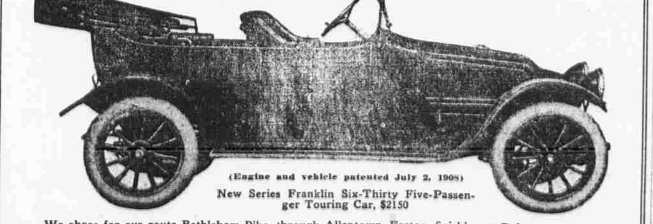
(Engine and vehicle patented July 2, 1908) New Series Franklin Six-Thirty Five-Passenger Touring Car, $2150

Test made on September 24 by Franklin dealers throughout the United States.