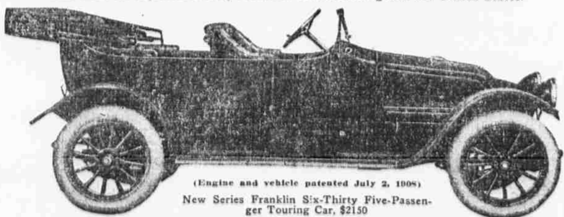
(Engine and vehicle patented July 2, 1908)

Test made on September 24 by Franklin dealers throughout the United States.