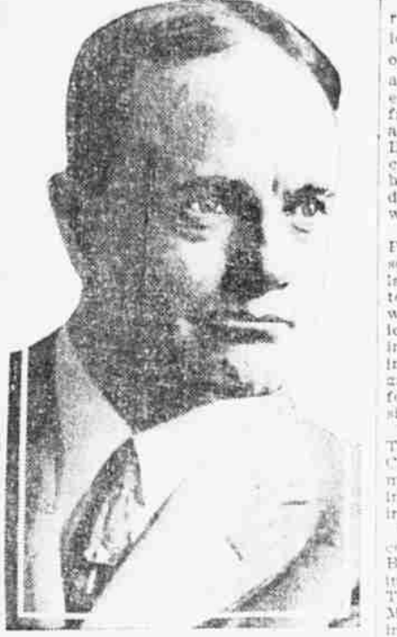
THE REV. W. A. SUNDAY Former baseball player, who has become a great evangelist. He is to conduct a campaign here the coming winter.

Initial plans for the campaign to be waged by "Billy" Sunday, the baseball evangelist, in this city during the coming winter, will be discussed at a mass meeting of the ministers of the city in the Central Y. M. C. A. on Monday at 11 o'clock.