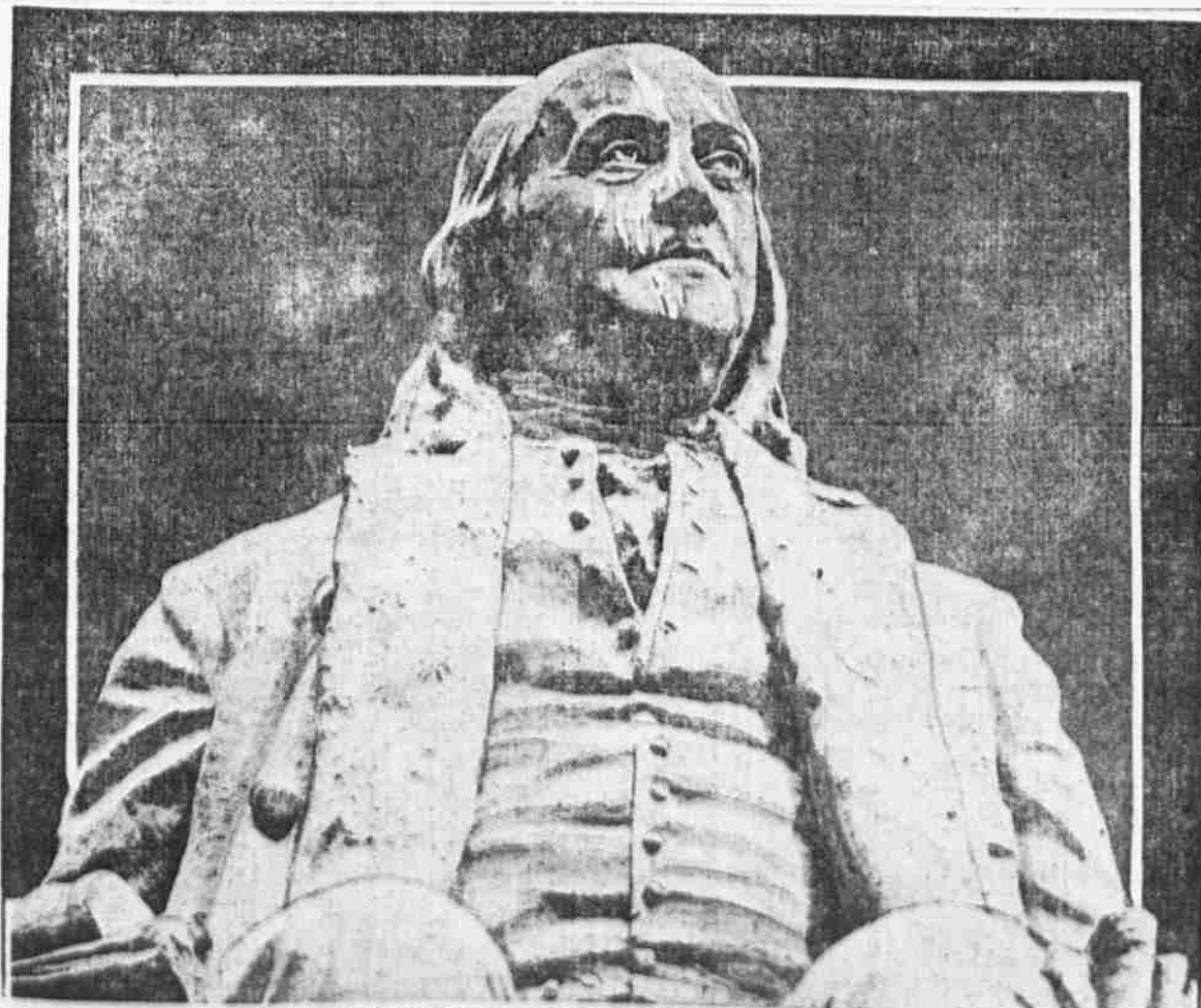
BEN FRANKLIN'S FACE IN NEED OF SCRUBBING