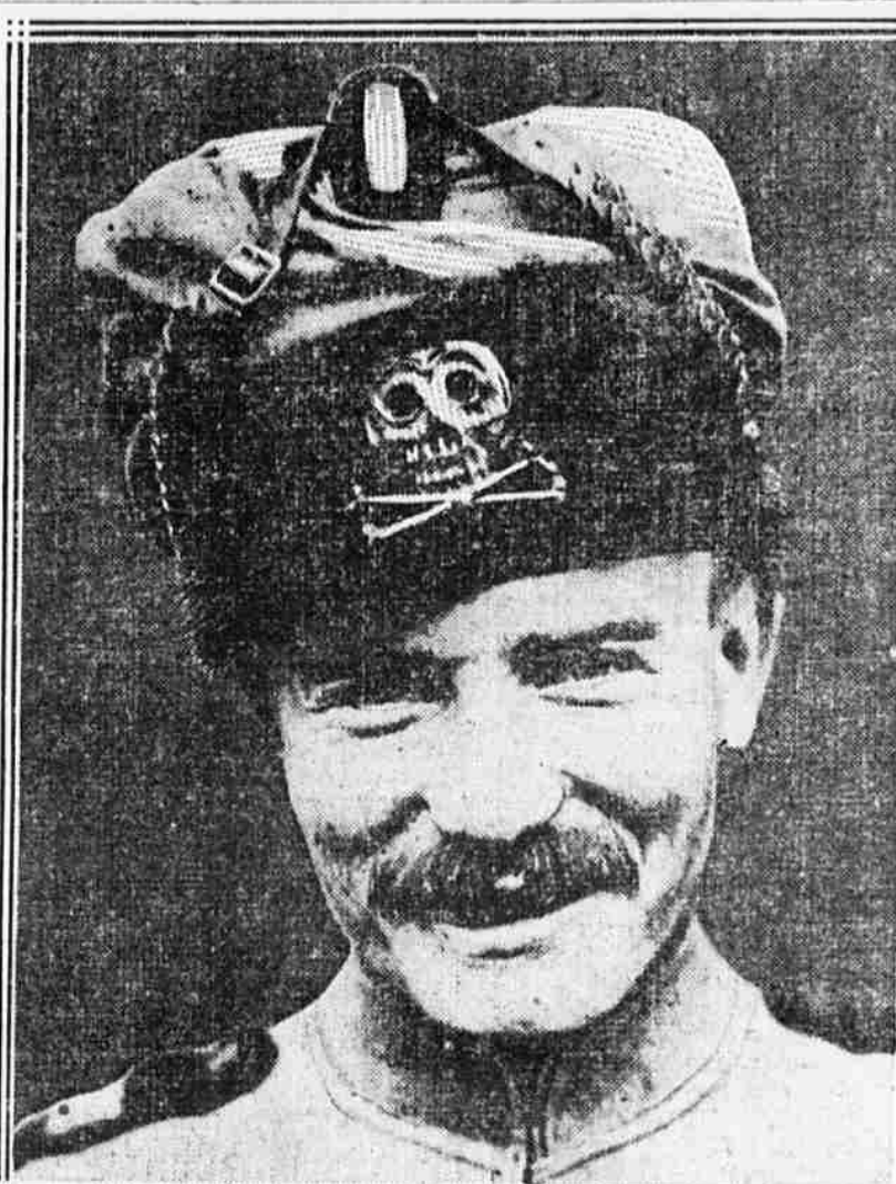
Death's Head Hussar, survivor of the famous regiment of the German Crown Prince. But fifty of these fierce warriors, it is said, remain after the terrific campaigns in the region of Verdun, where the Teuton Prince hurled his forces against the French stronghold.