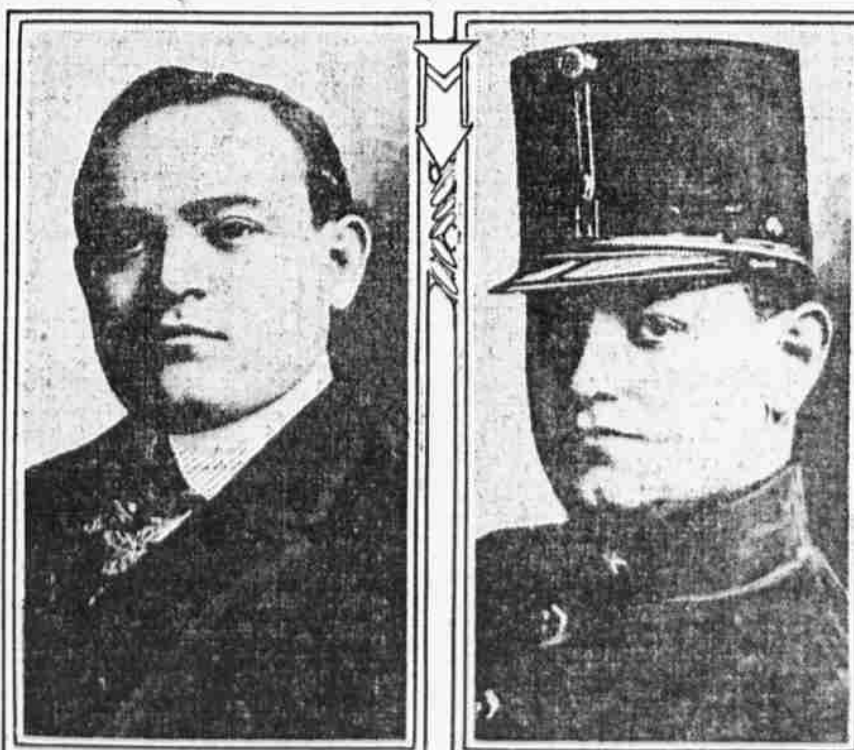
AUSTRIAN OFFICERS, HELD BY THE ENGLISH, COME TO PHILADELPHIA WHEN RELEASED

Perry & Co., "N.B.T." 16th & Chestnut Sts.