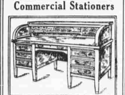
Largest and most fairly priced stock to be found anywhere.

Convenience, comfort and good taste-essential to every well-ordered officeare conspicuous features of offices furnished by us.