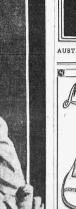
lade with great st care, over asts scientifical

Sturdy School Shoes ur deservedly famous "Room-for-toes" footwear for children is a sign-for correct-fitting of the growing. These shoes are recommended by stains for their correct construction, by us for good appearance and wear-ability.