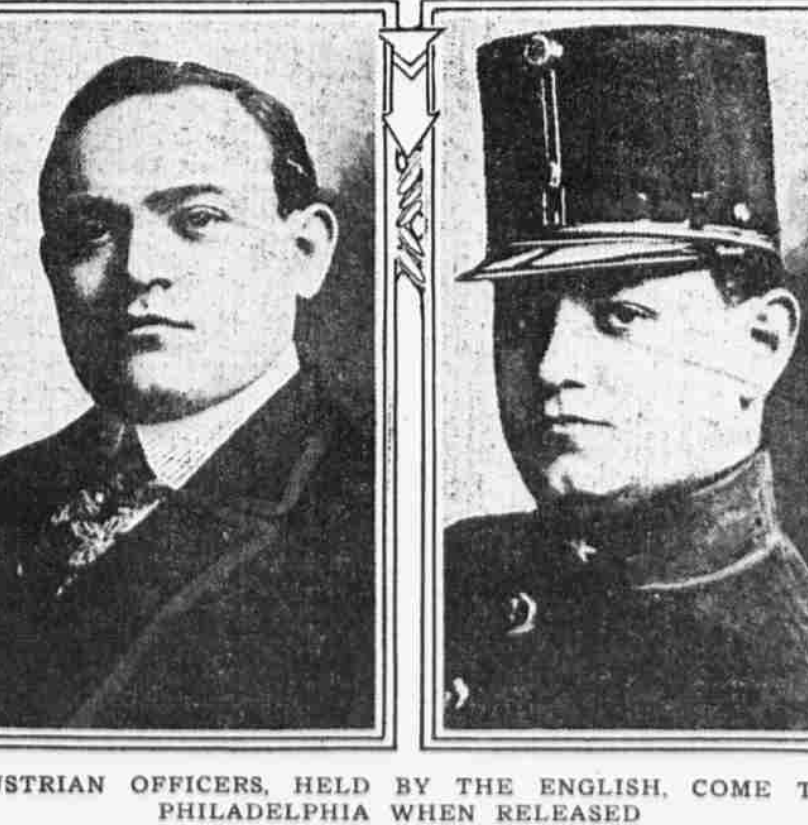
AUSTRIAN OFFICERS, HELD BY THE ENGLISH, COME TO