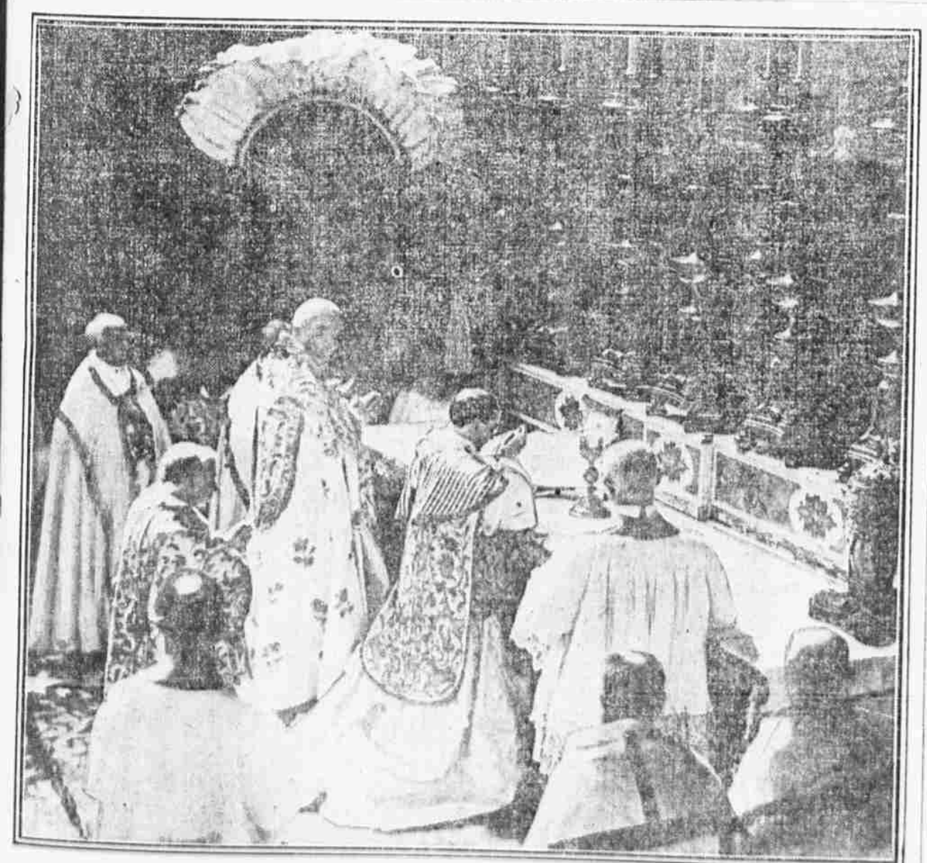
FIRST PHOTOGRAPHS OF THE NEW POPE TAKEN DURING HIS CORONATION. THE POPE IS SHOWN KNEELING BEFORE THE ALTAR IN THE SISTINE CHAPEL