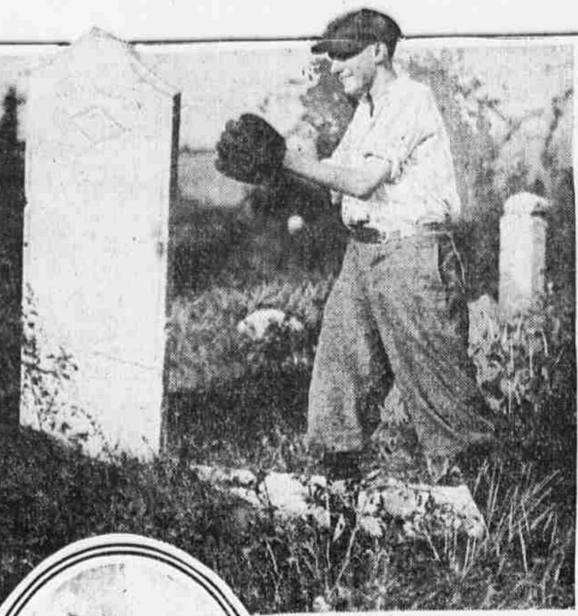
THIS STONE AS BIG AS THE RIGHT FIELDER