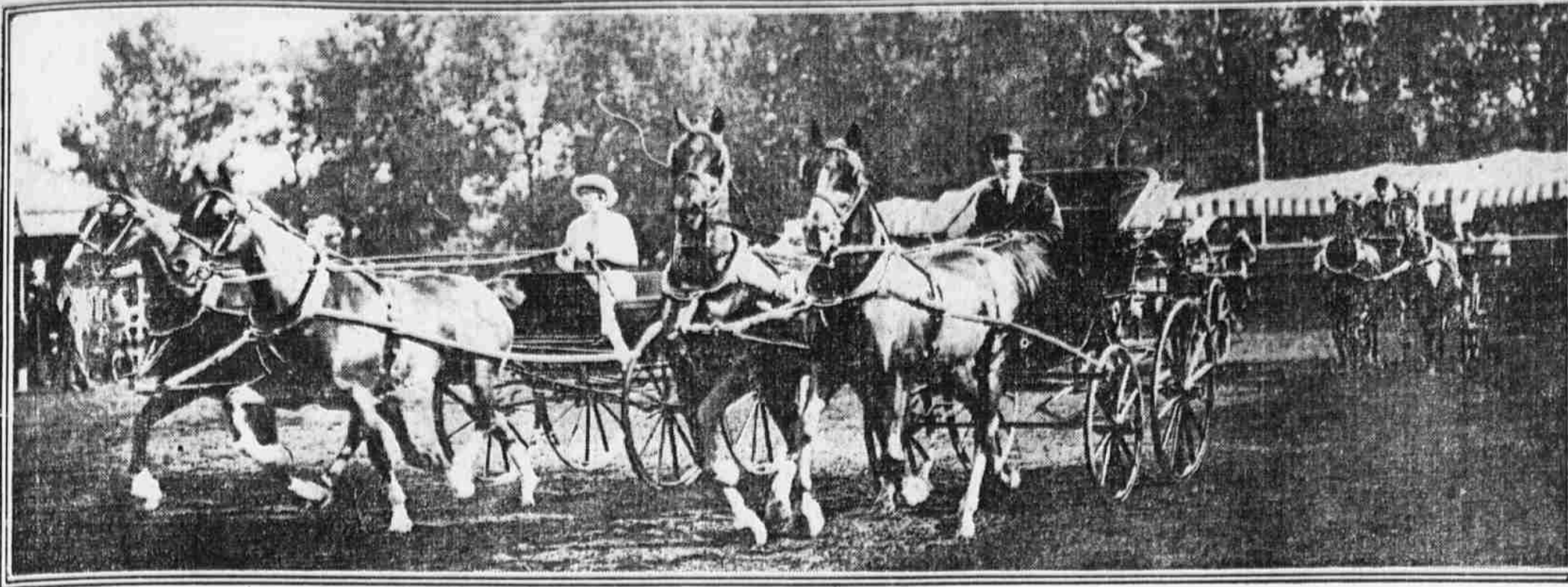
A GENERAL VIEW OF THE OVAL. PAIRS OF HARNESS HORSES BEING JUDGED