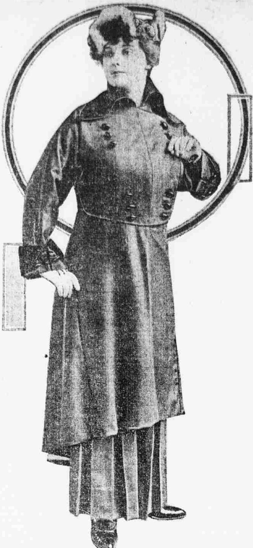
AN INCOMPLETED COSTUME WHICH AWAITS A FINAL FITTING FOR ITS LAST TRIUMPHANT STITCH

THE RETURN TRIP. In half an hour my luggage was transferred, and I stood awed within the portals of the finest railway station in the world. I thought I must be back in dear Saint Paul's Cathedral once again. No sign of smoke or train was there, and yet its name was Pennsylvania Railroad Station. In the hush of its vast