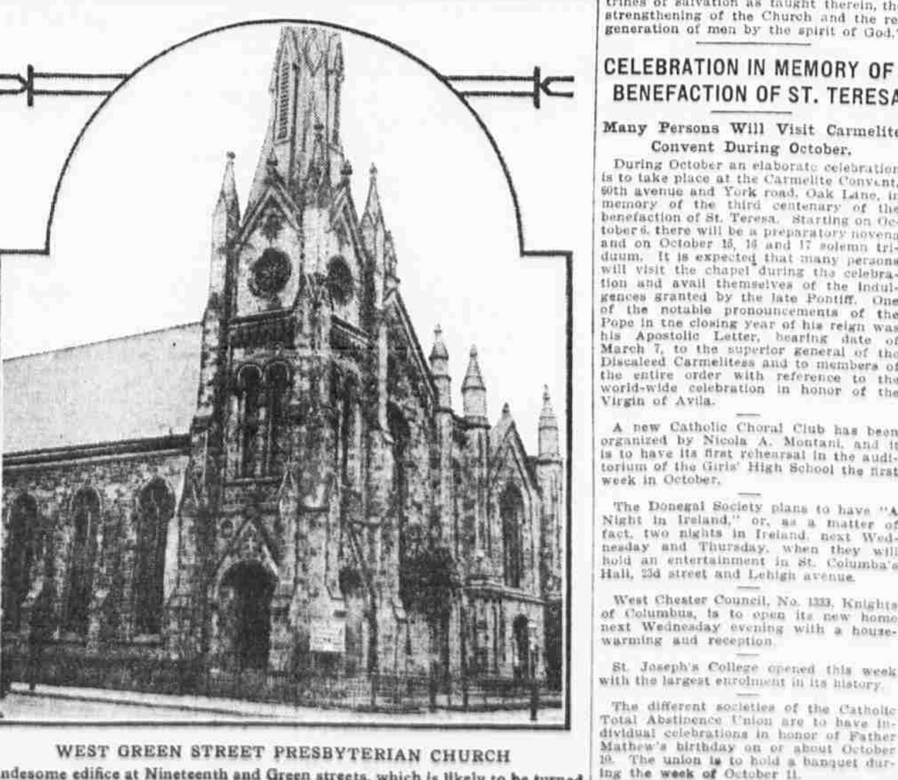
WEST GREEN STREET PRESBYTERIAN CHURCH Handsome edifice at Nineteenth and Green streets, which is likely to be turned over to Philadelphia Presbytery and offered for sale in the early future.