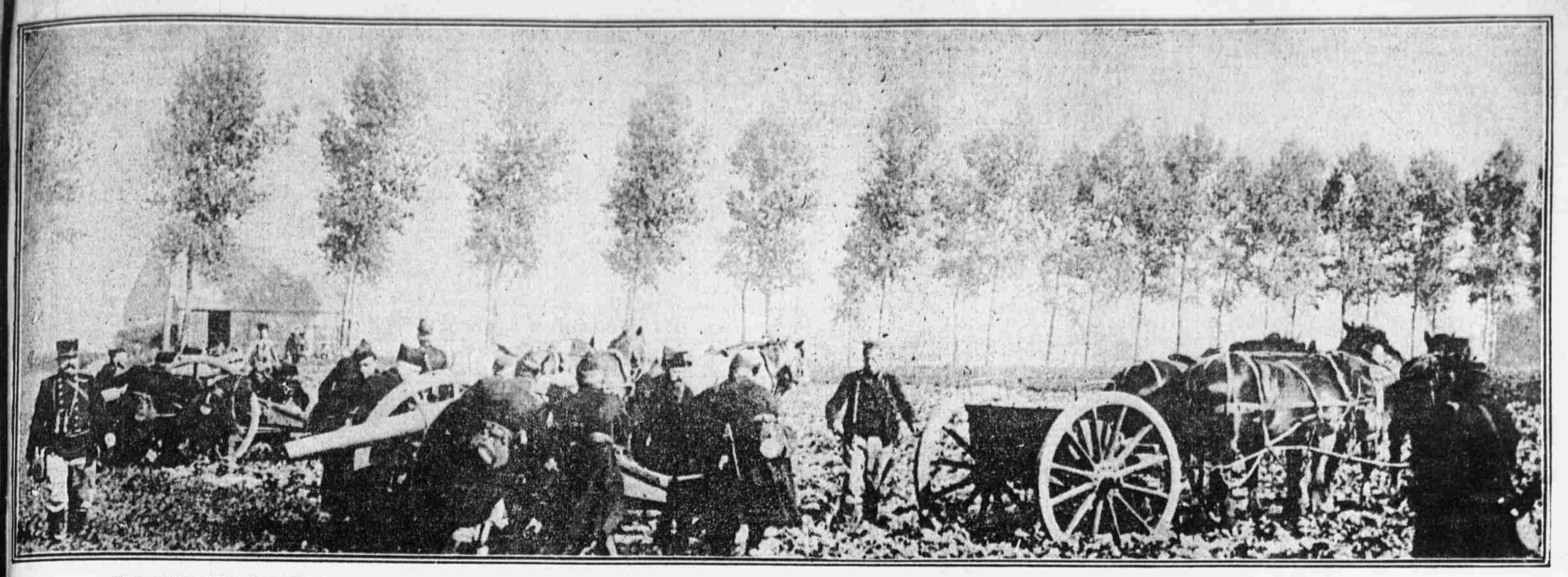
IT IS DEVELOPING AS PREDICTED THAT ARTILLERY IS THE DOMINANT FACTOR OF THE FIGHTING IN EUROPE WITH GERMANY SEEMING TO HAVE A SLIGHT ADVANTAGE OVER THE ALLIES