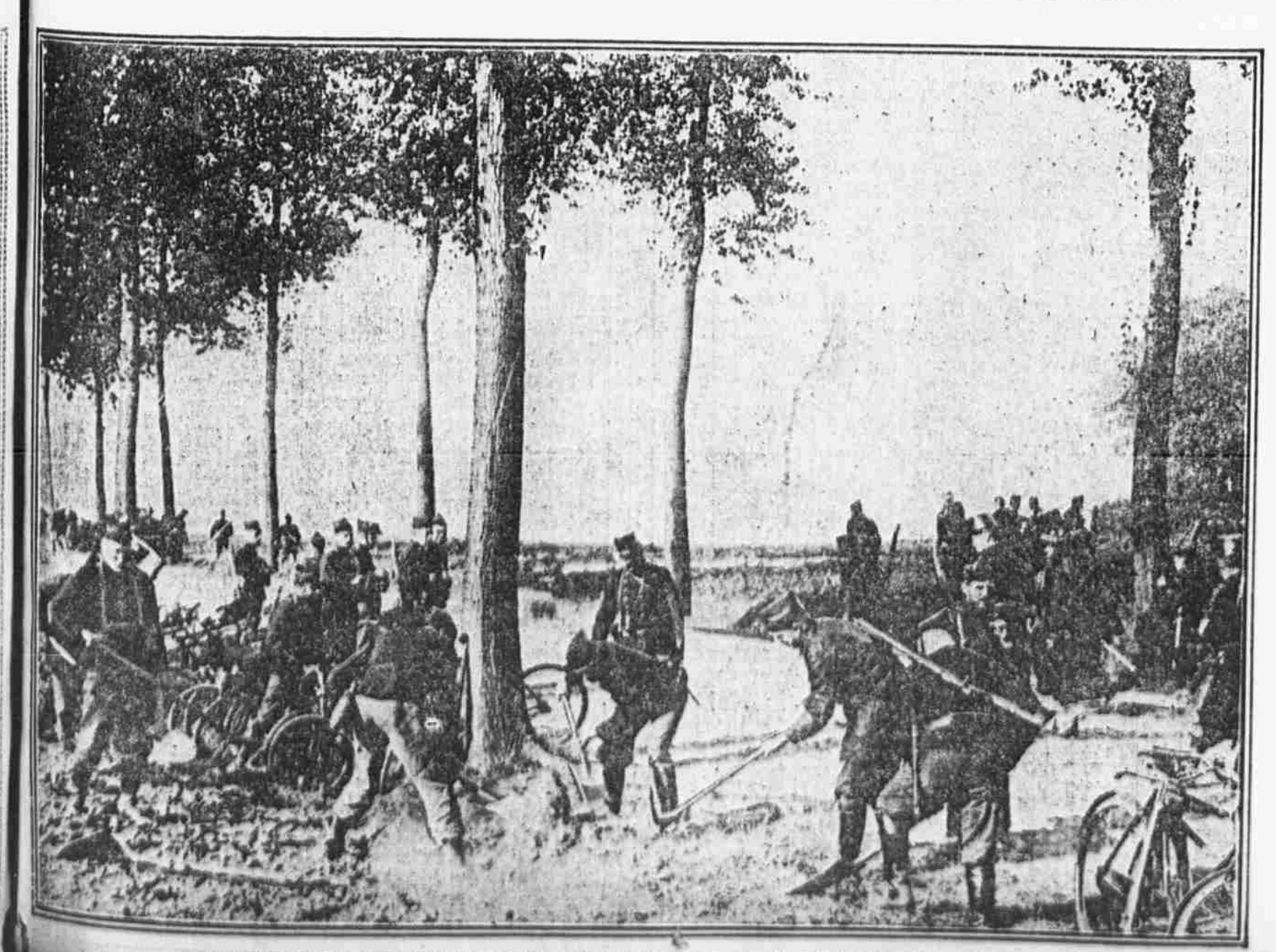
THE COUNTRY FOR MILES ABOUND ANTWERP HAS BEEN PREPARED FOR DEFENSE