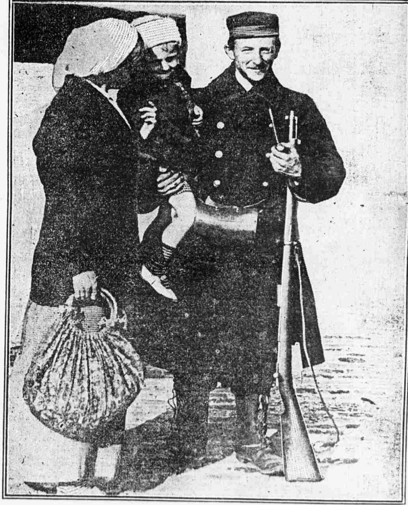
BETWEEN BATTLES BELGIAN WOMEN S " " THEIR BUSBANDS ON THE FIELD