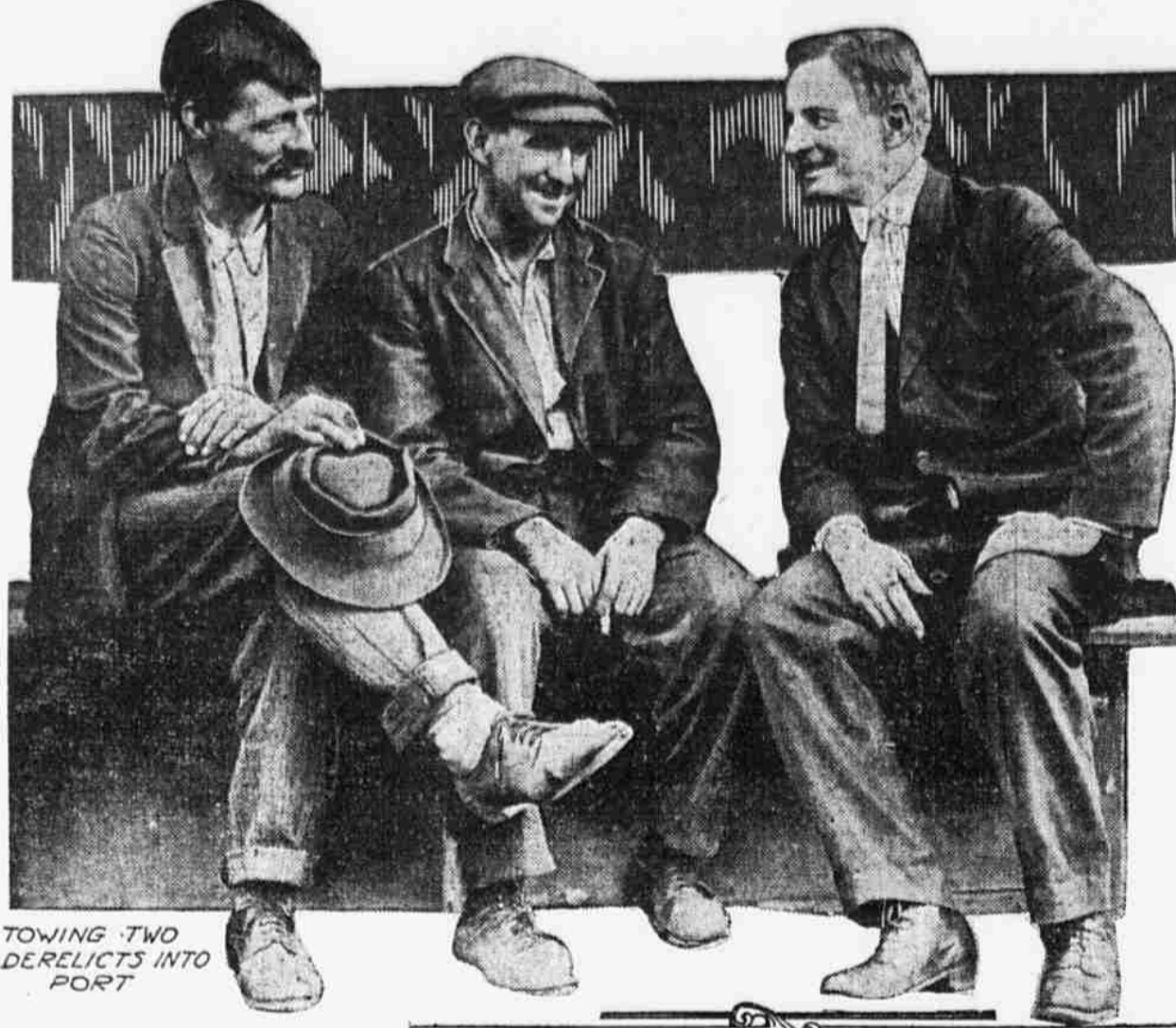
TOWING TWO DERELICTS INTO PORT