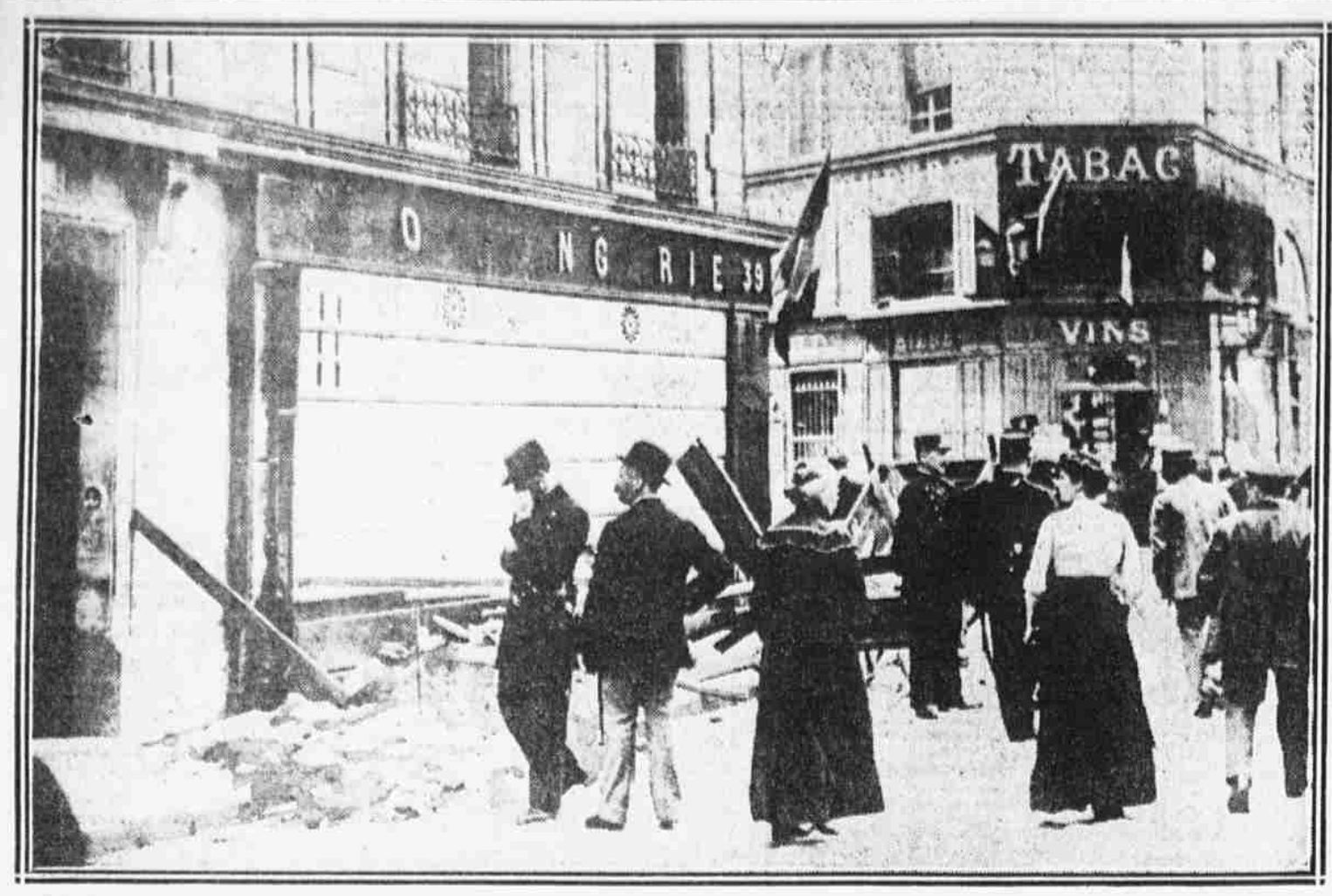
WRECKAGE IN PARIS CAUSED BY BOMBS DROPPED BY GERMAN AVIATORS FROM AEROPLANES In the main the effect of aerial bombardments has been far less than was expected. Damage in Paris has been trifling and there has been complete absence of panic among the people. As a scout, the aeroplane seems to render its most effective service.