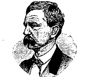
GEN. FRANK P. BLAIR, JR., OF MISSOURI.

THE NEXT ISSUE OF THE WEEKLY INTELLIGENCER will be mailed on Saturday morning next.