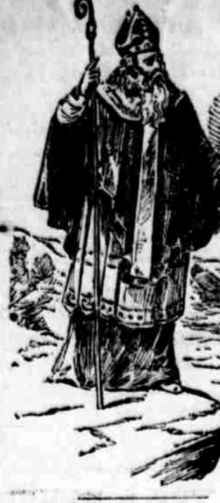
RELICS OF ST. PATRICK. His Chair and Bell—The Kitchen of St. Kevin.

Of course Ireland abounds in memorials of the saints, and most of St. Patrick, whose noted "chair" is a rudely fashioned rock in the Glen of Altavue. The tradition is that it was originally a "cromlech" or Druid monument, and to make it a memorial of the fact that the old religion had been driven out of the country.