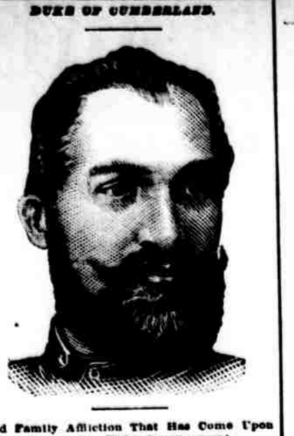
THE DUKES OF CUMBERLAND. The Duke of Cumberland (whose wife is the Princess Thyra of Denmark, who was consigned to an asylum for the insane) is an individual of no small importance in European court circles...

W. D. Hoyt & Co. Wholesale and Retail Druggists of Home, Pa., says: "We have been selling SICKNER'S ARTERIA for two years, and have such universal cures effected by these medicines in this city. Consumption has been cured by the use of a few bottles of the Siga's New Discovery, and taken in connection with electricity. Many cases were cured by the use of this medicine."